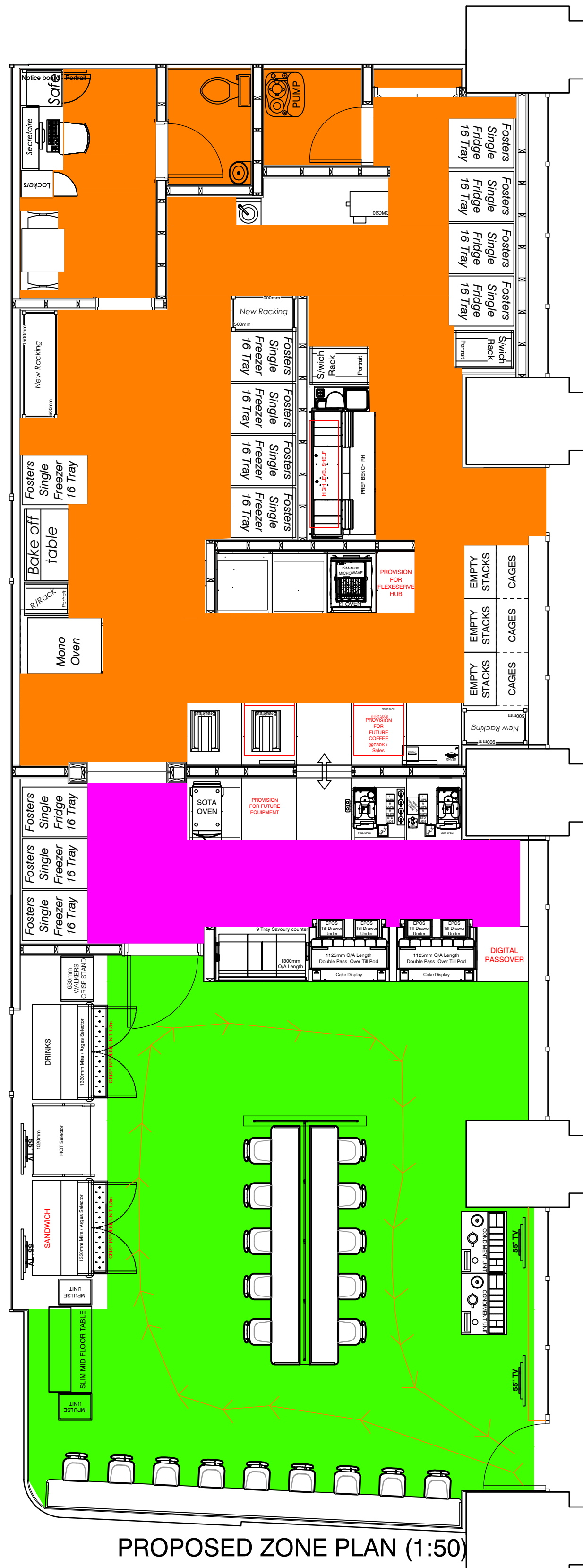
PROPOSED ZONE PLAN (1:50)

EMERGENCY LIGHTING INSTALLATION CERTIFICATE TO BE ISSUED. AN EMERGENCY LIGHTING LOG BOOK TO BE KEPT ON SITE AT ALL TIMES . ALL CONTRACTORS TO REFER TO TFL DETAIL DELIVERY FIT OUT TECHNICAL GUIDES FOR FULL DETAILS TO ENSURE FITTINGS AND INSTALLATIONS ARE COMPLIANT