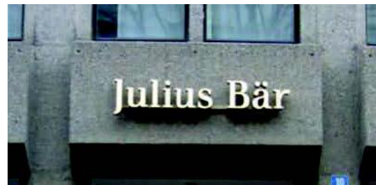
DESIGN INTENT EXAMPLE NOT TO SCALE