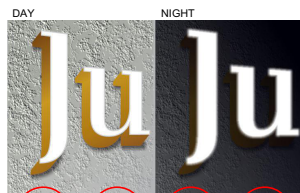
DESIGN INTENT: WHITE OPAL FRONT LACQUERED BRONZE SIDES - ILLUMINATED TO 600 LUMENS

DRAWINGS INDICATE DESIGN INTENT ONLY. ALL DIMENSIONS IN MILLIMETRES UNLESS OTHERWISE NOTED. THE CONTRACTOR IS RESPONSIBLE FOR TAKING AND CHECKING ALL DIMENSIONS. DO NOT SCALE FROM THE DRAWING. REPORT ALL CONFLICTS OF INFORMATION TO HLW AND SEEK ADVICE BEFORE PROCEEDING. THIS DRAWING IS THE COPYRIGHT OF HLW INTERNATIONAL LTD.