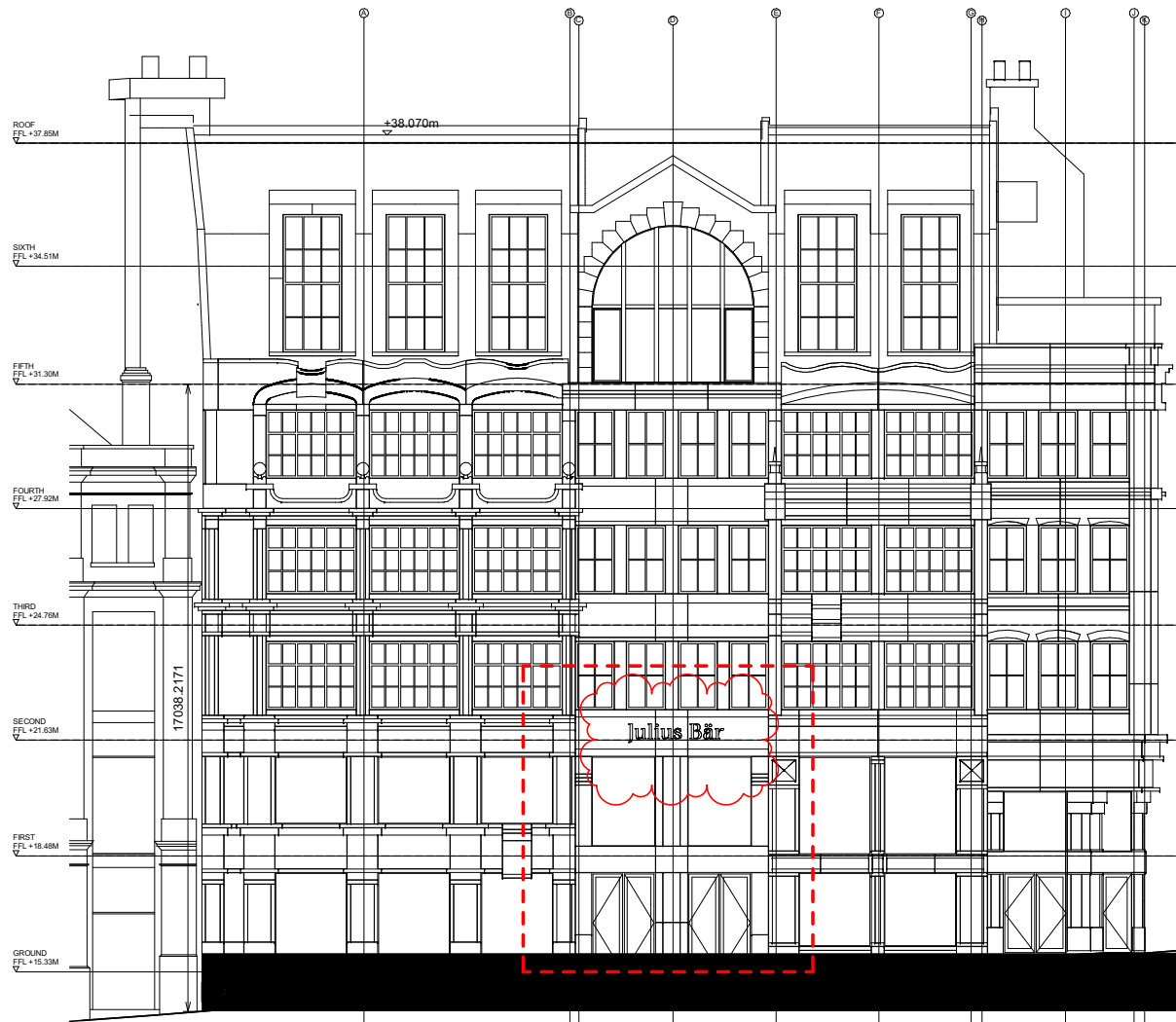
1 NORTH ELEVATION 1:100