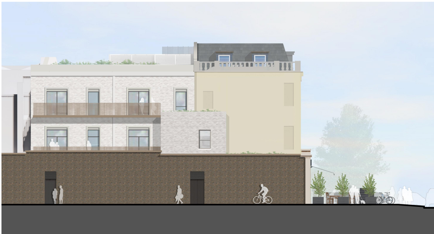
1 Proposed Rear Elevation C-C 1 : 200