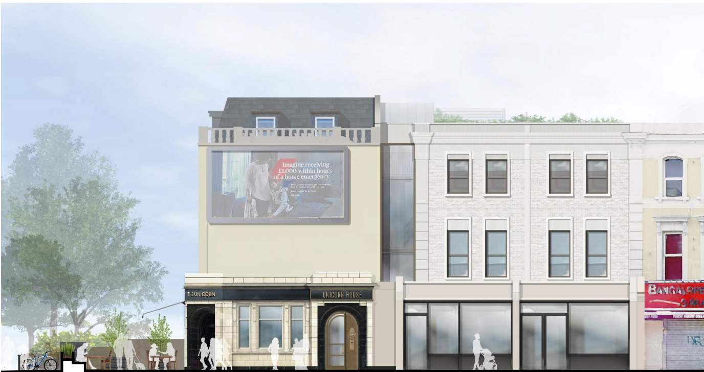
1 Proposed Brecknock Road Elevation B-B 1 : 200