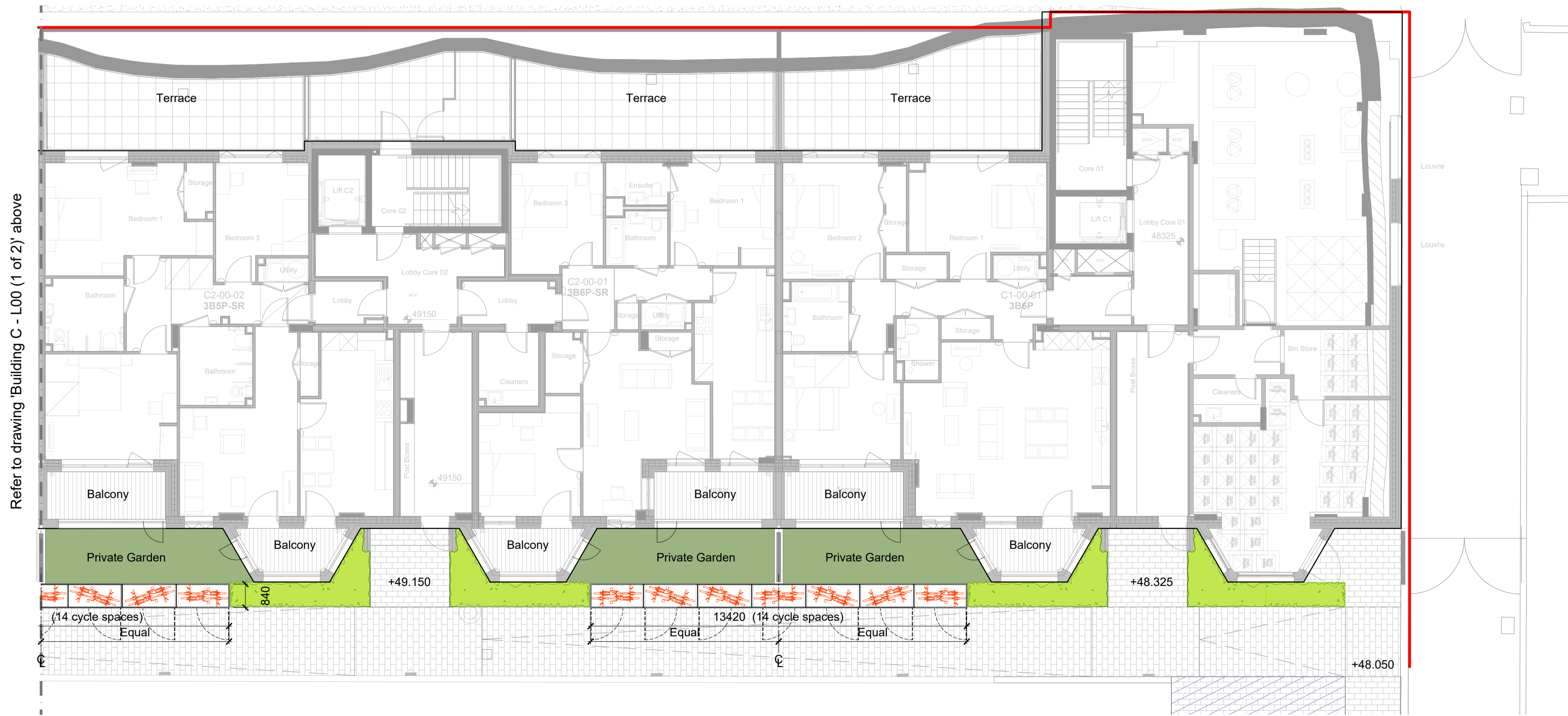
A 051 Building C - L00 (1 of 2)

Refer to drawing 'Building C - L00 (1 of 2)' above