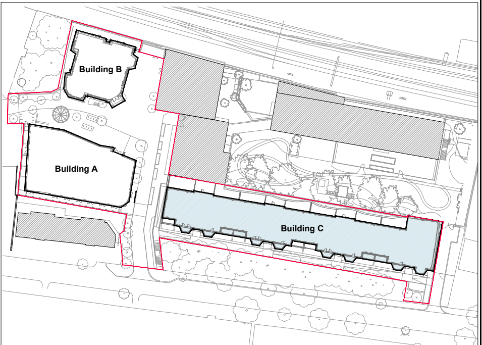
Location Plan (N.T.S.)