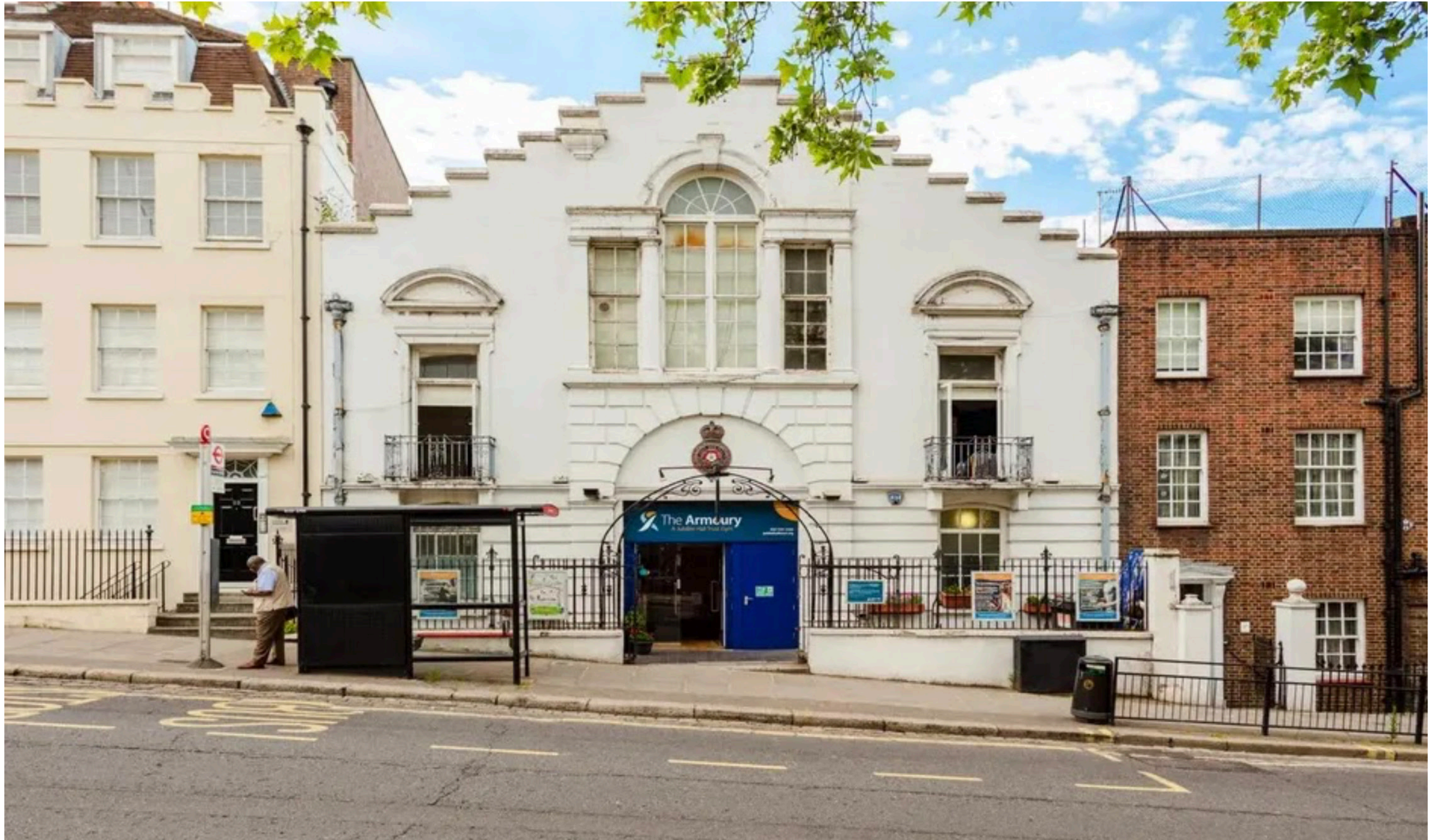
The Armoury Gym - Hampstead