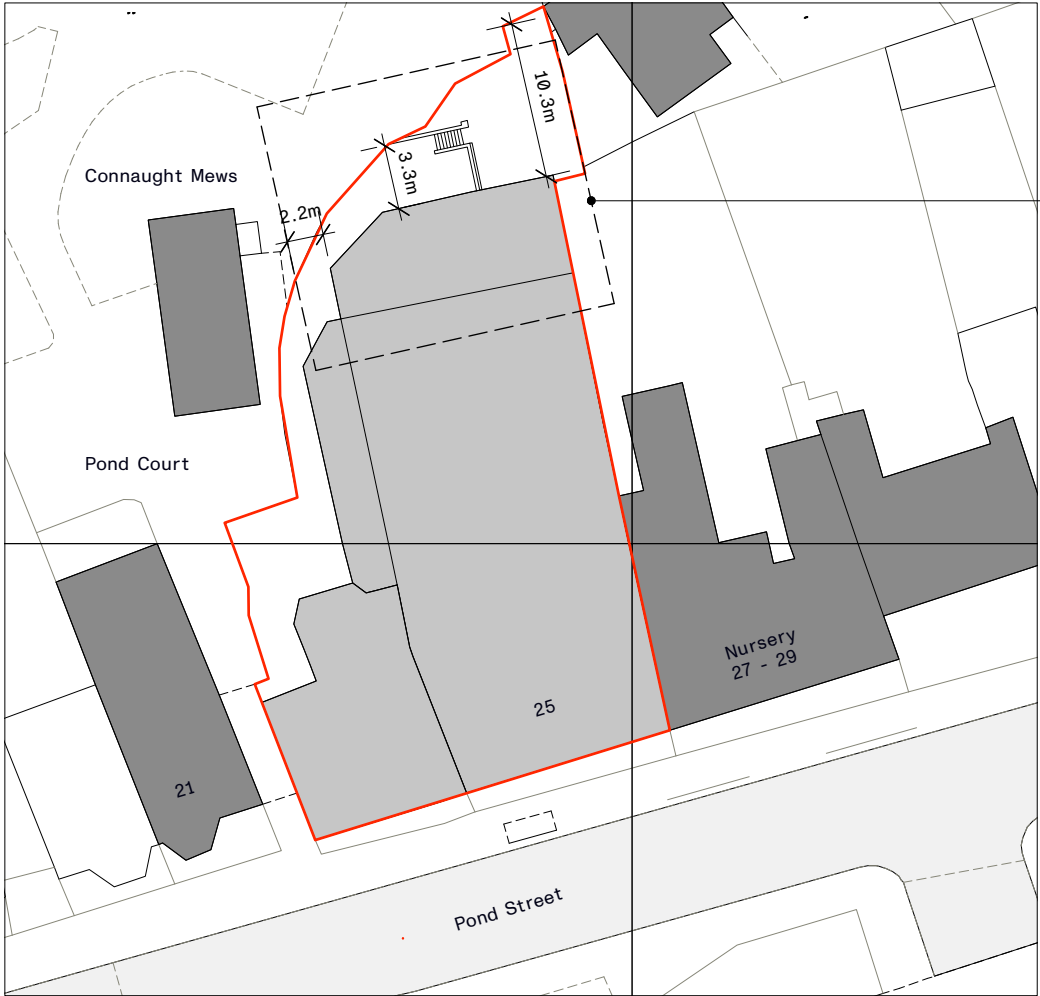
Block Plan @ 1:500