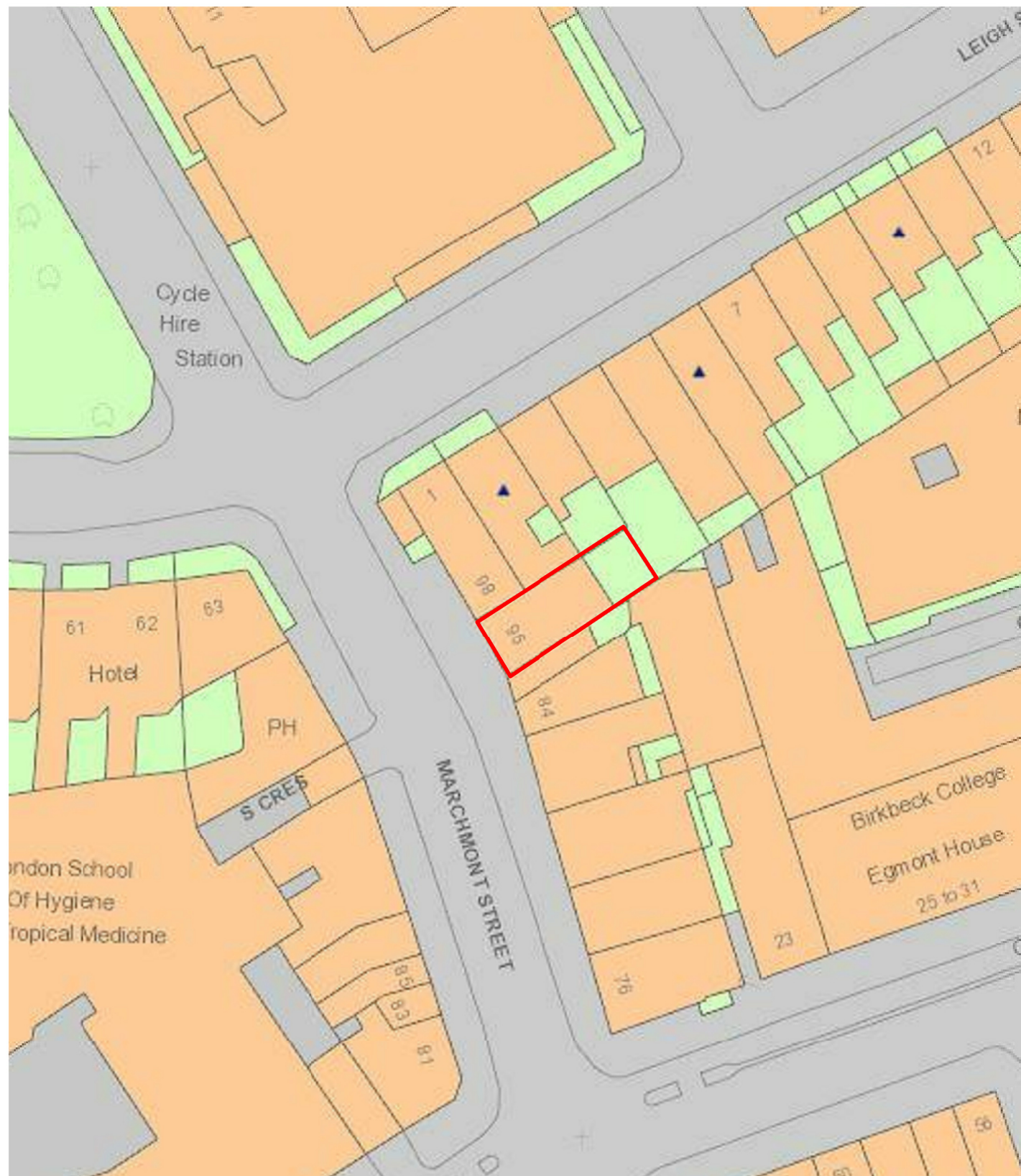
BLOCK PLAN 1 : 500 @A3