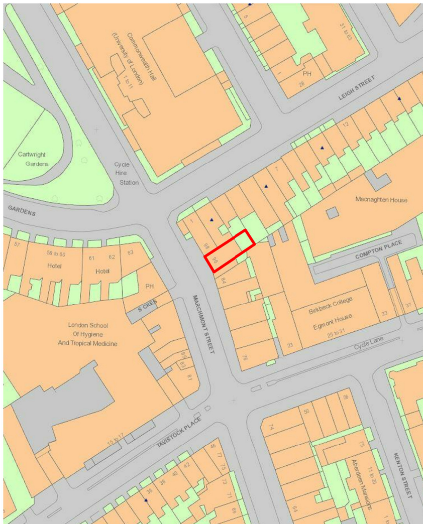
LOCATION PLAN 1 : 1250 @A3