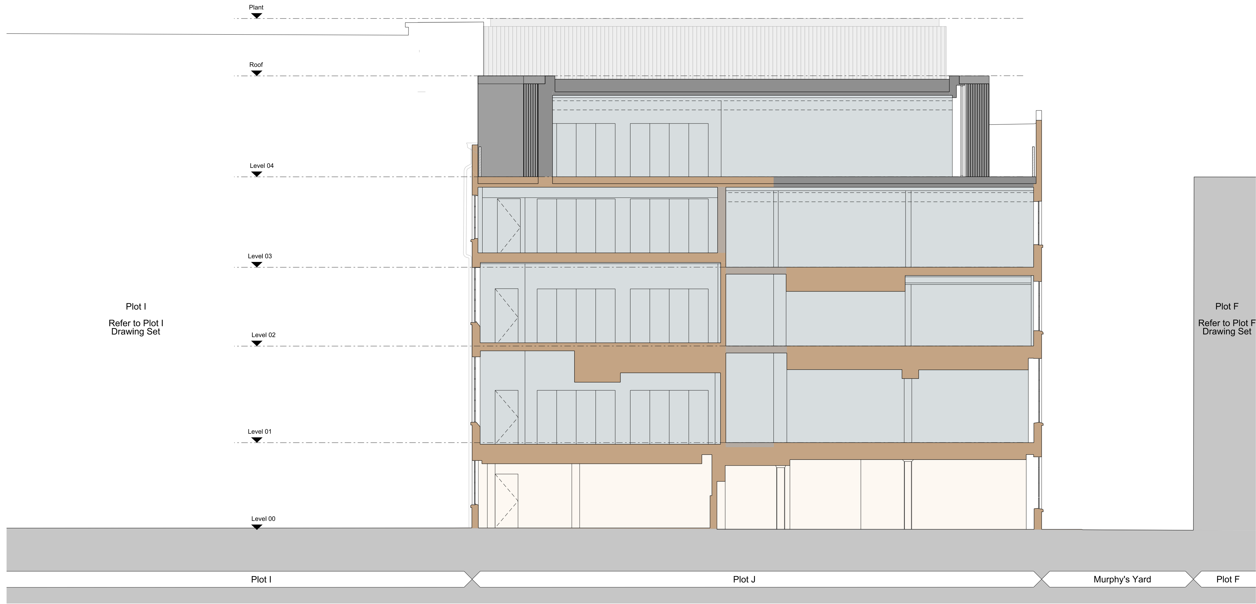
1 PLOT J SECTION AA SCALE 1:100