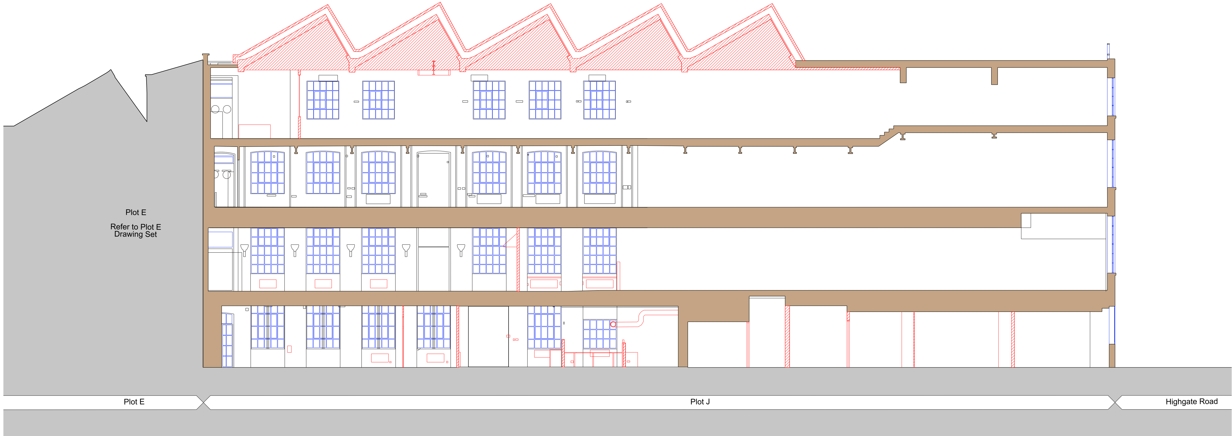
2 PLOT J SECTION BB SCALE 1:100

NOTES This drawing is copyright Piercy&Company. Do not scale from this drawing. All dimensions and levels to be checked on site by the contractor and such dimensions to be his responsibility. Report all drawing errors, omissions and discrepancies to the architect.