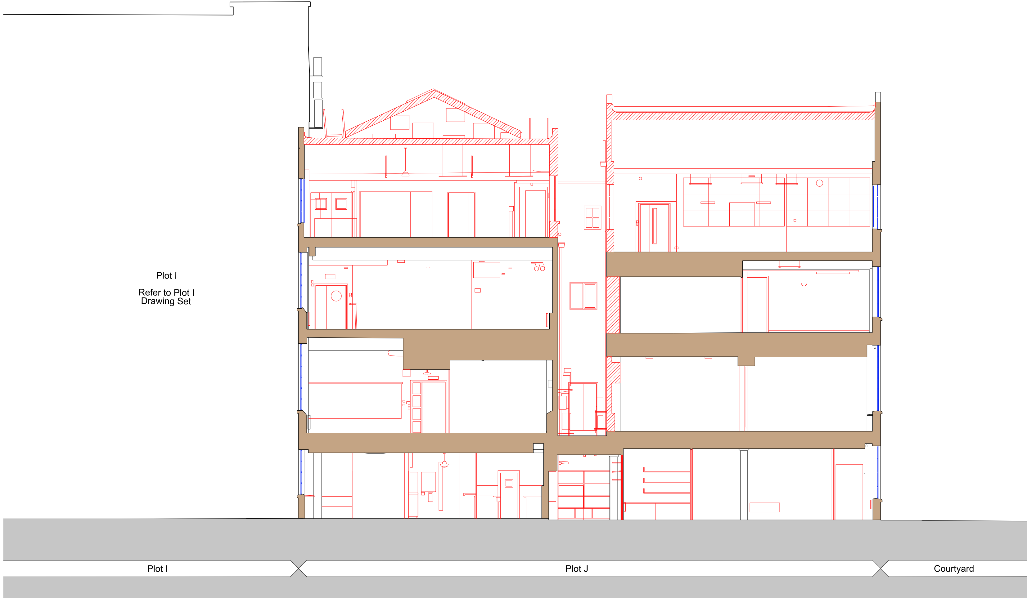
1 PLOT J SECTION AA SCALE 1:100