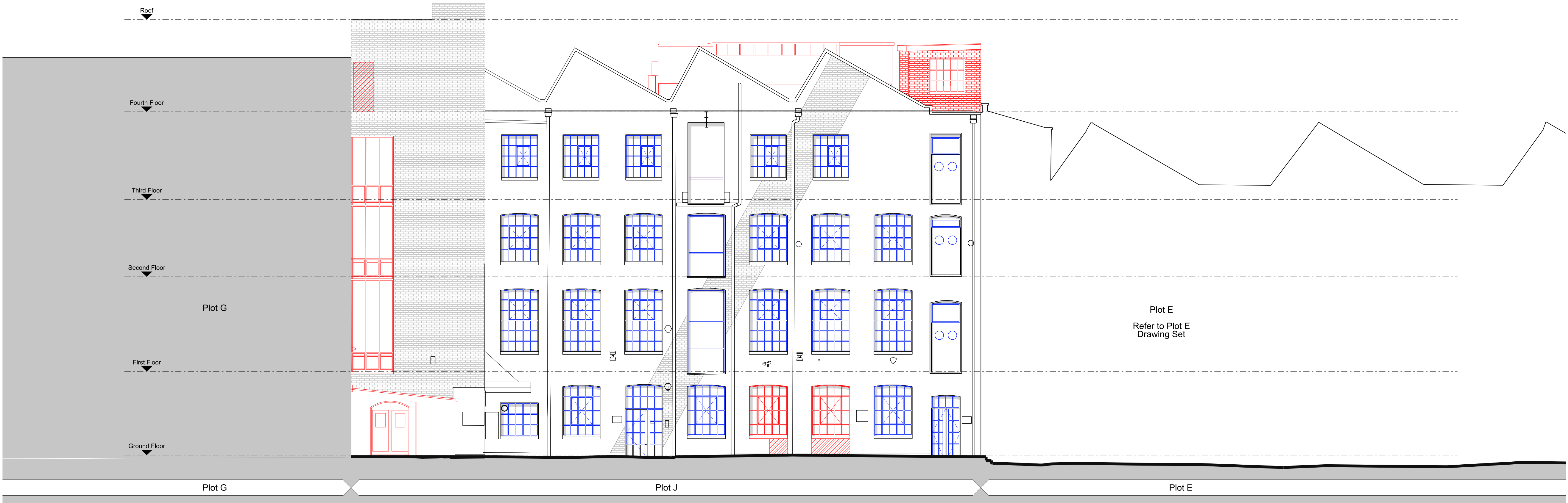
2 PLOT J ELEVATION THE YARD SANDERSON CLOSE SCALE 1:100

NOTES This drawing is copyright Piercy&Company. Do not scale from this drawing. All dimensions and levels to be checked on site by the contractor and such dimensions to be his responsibility. Report all drawing errors, omissions and discrepancies to the architect.