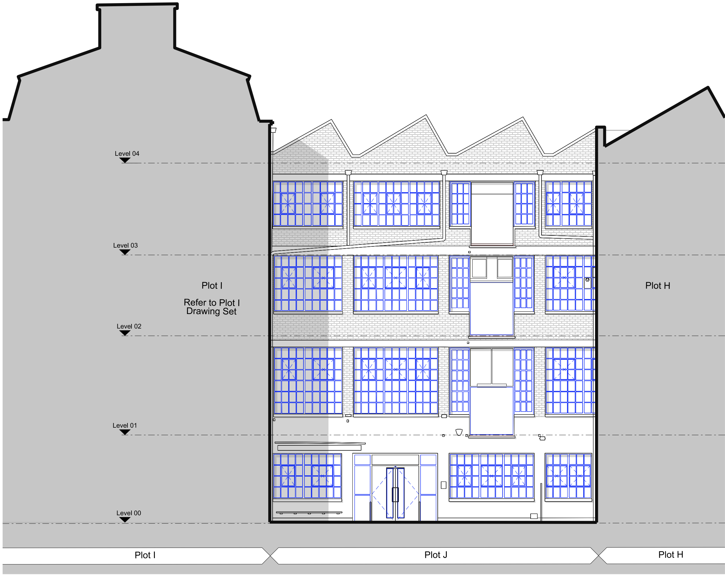
1 PLOT J ELEVATION THE YARD HIGHGATE PASSAGE SCALE 1:100