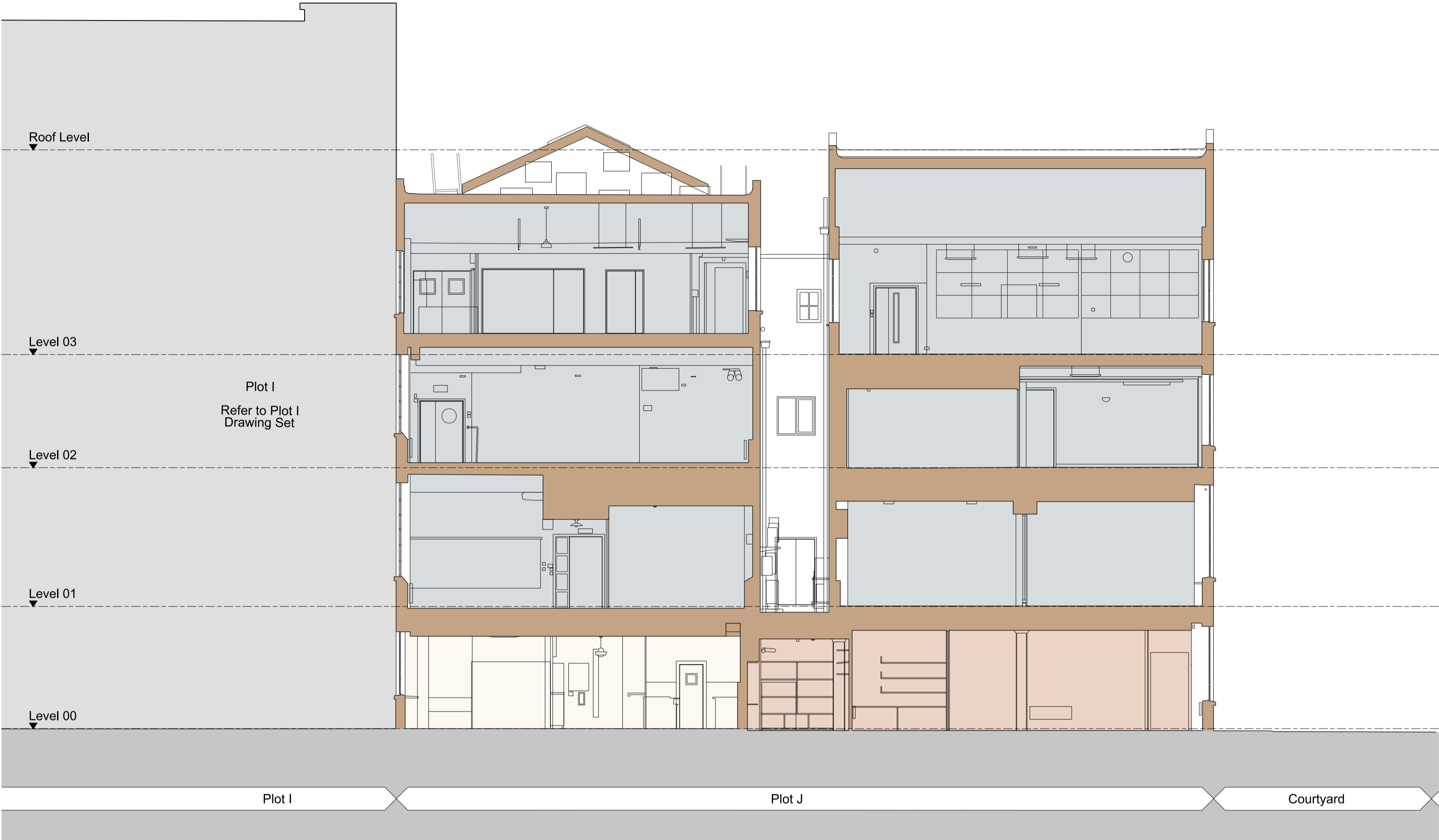
1 PLOT J SECTION AA SCALE 1:100