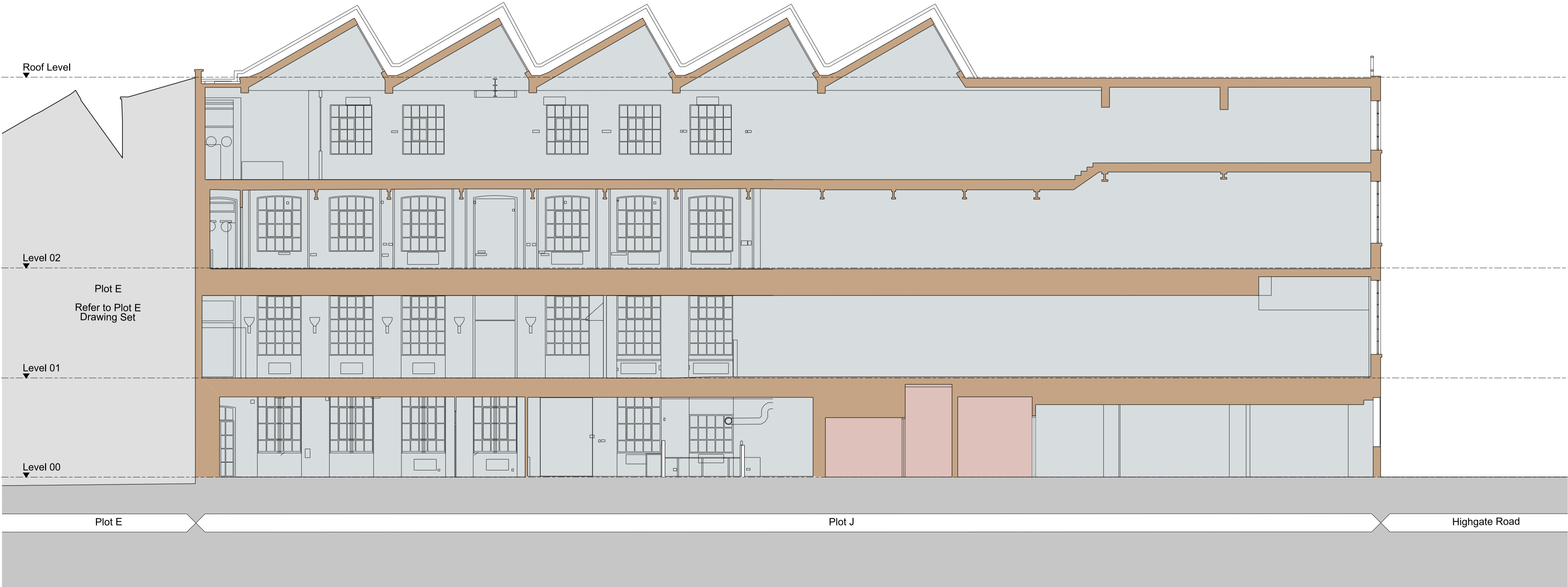
2 PLOT J SECTION BB SCALE 1:100

NOTES This drawing is copyright Piercy&Company. Do not scale from this drawing. All dimensions and levels to be checked on site by the contractor and such dimensions to be his responsibility. Report all drawing errors, omissions and discrepancies to the architect.