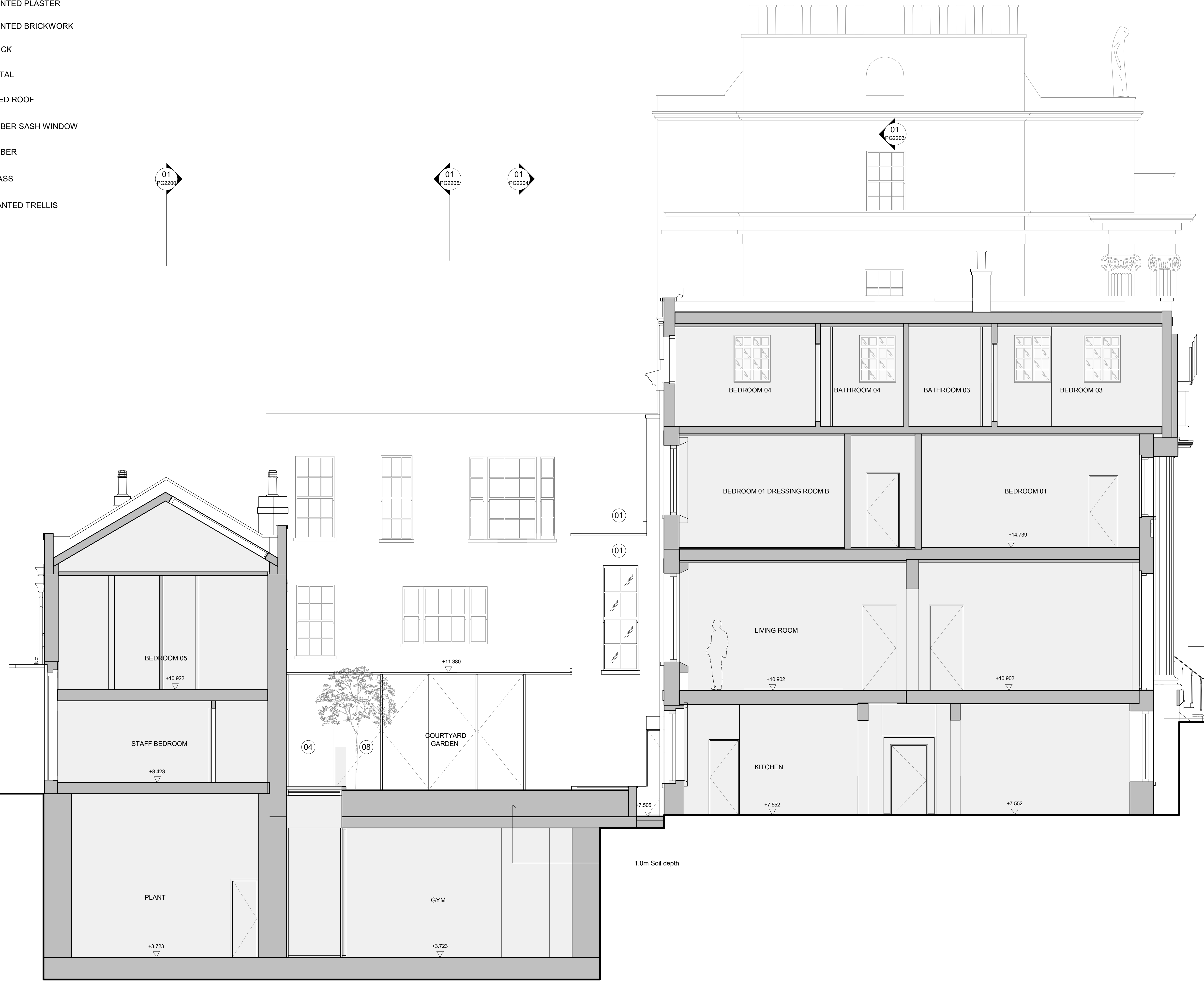
01 Consented Section B 1 : 50