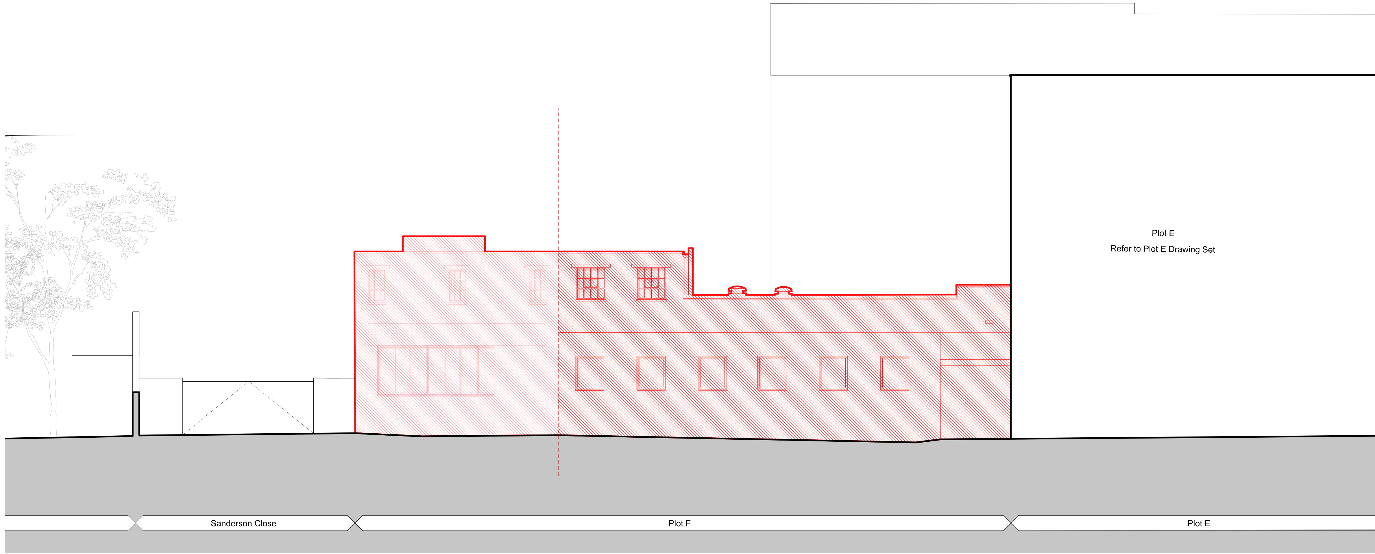
3 PLOT F SOUTHWEST ELEVATION SCALE 1:100