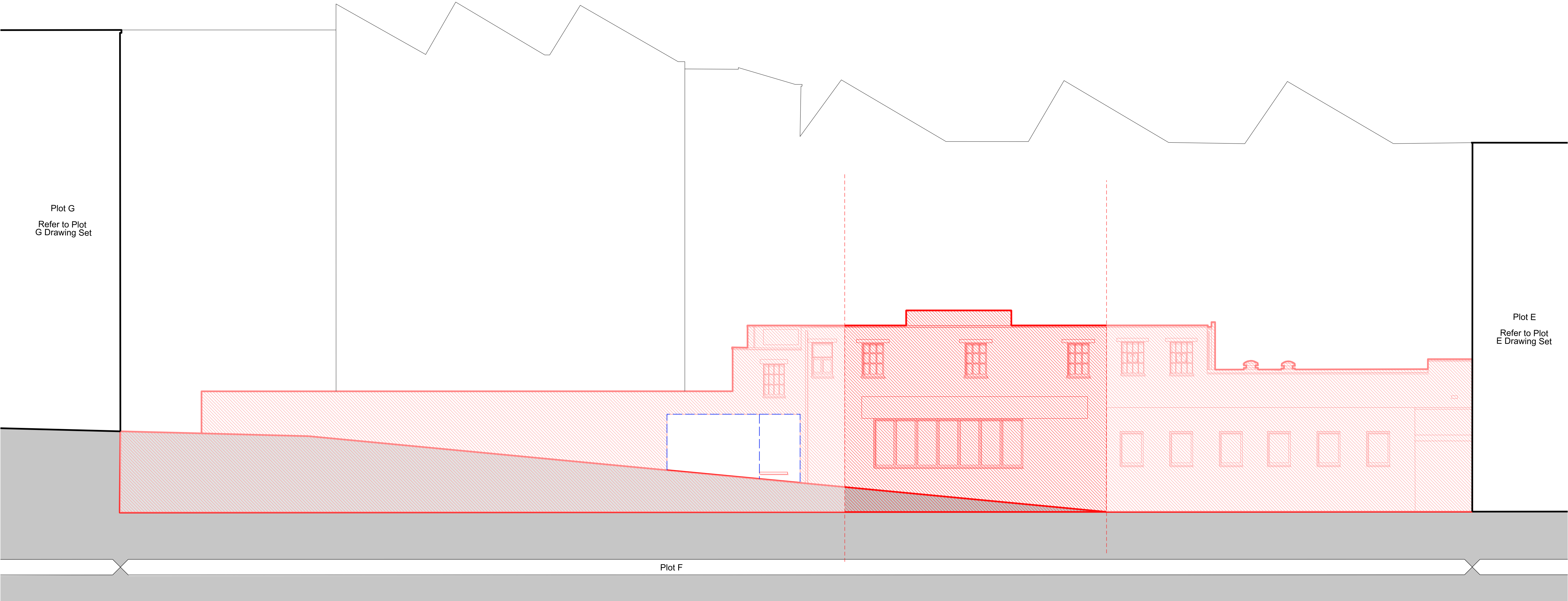
1 PLOT F WEST ELEVATION SCALE 1:100