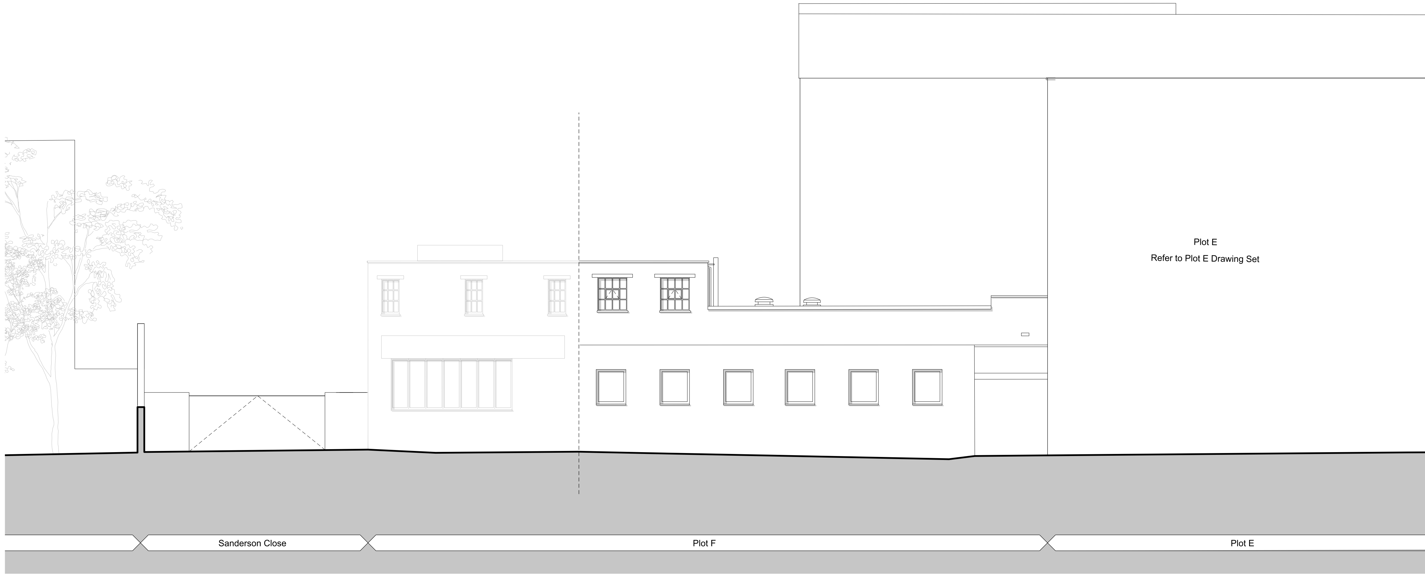
3 PLOT F SOUTHWEST ELEVATION SCALE 1:100