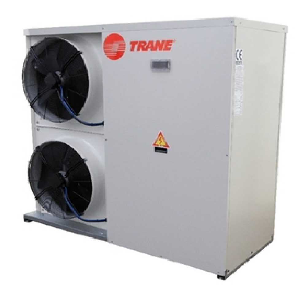
Proposed chiller unit - Trane CGB 025