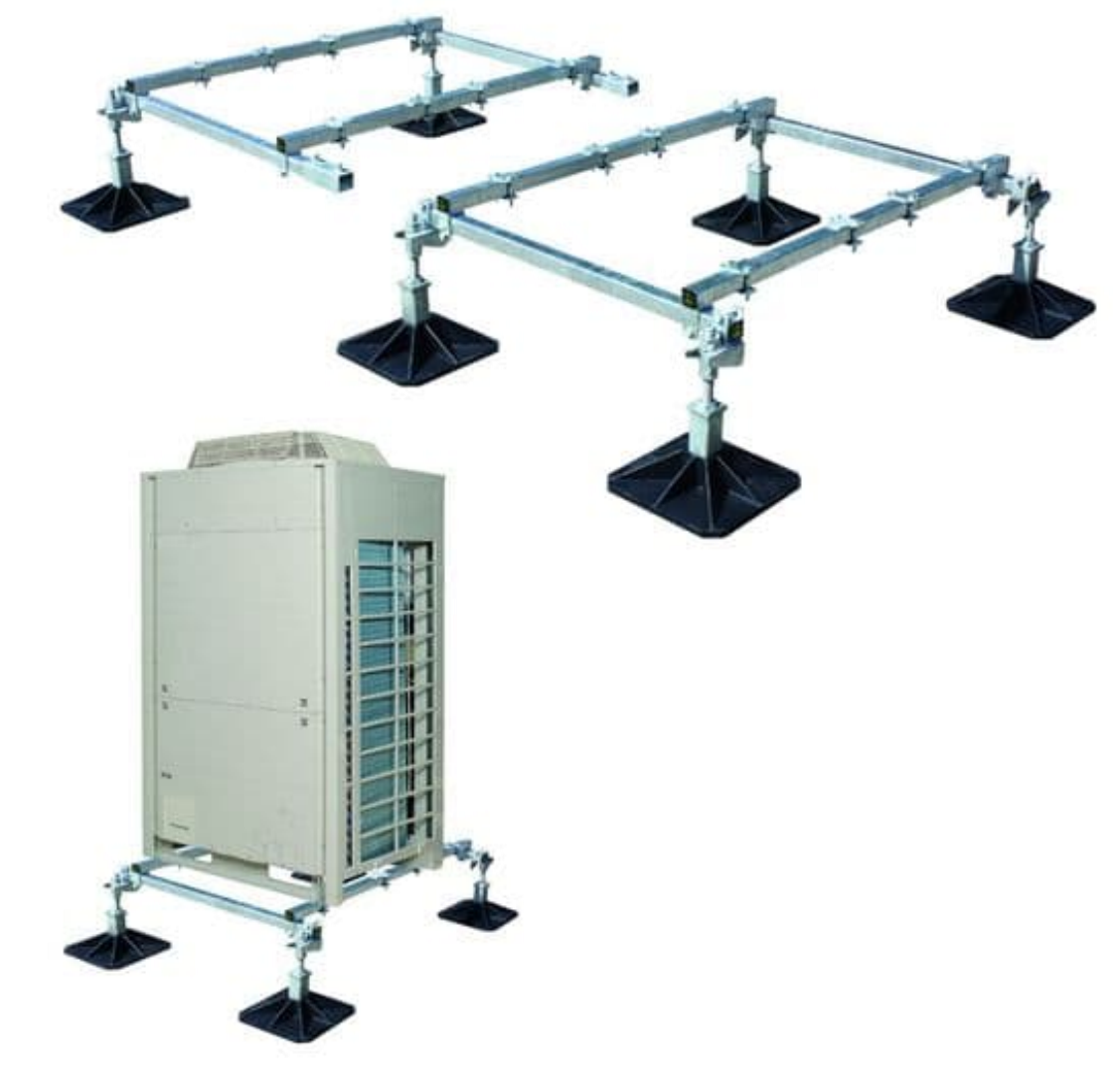
Example Big Foot Support System