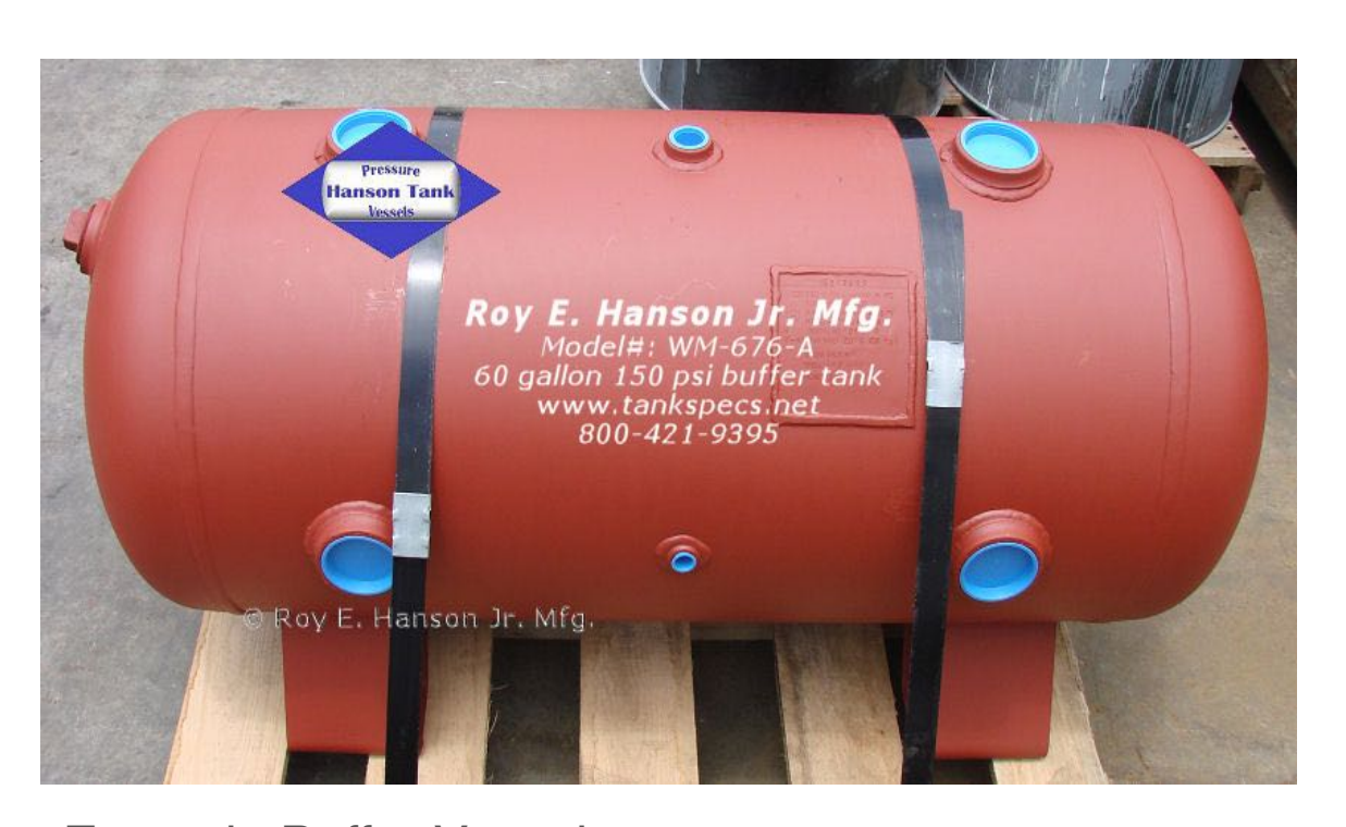
Example Buffer Vessel