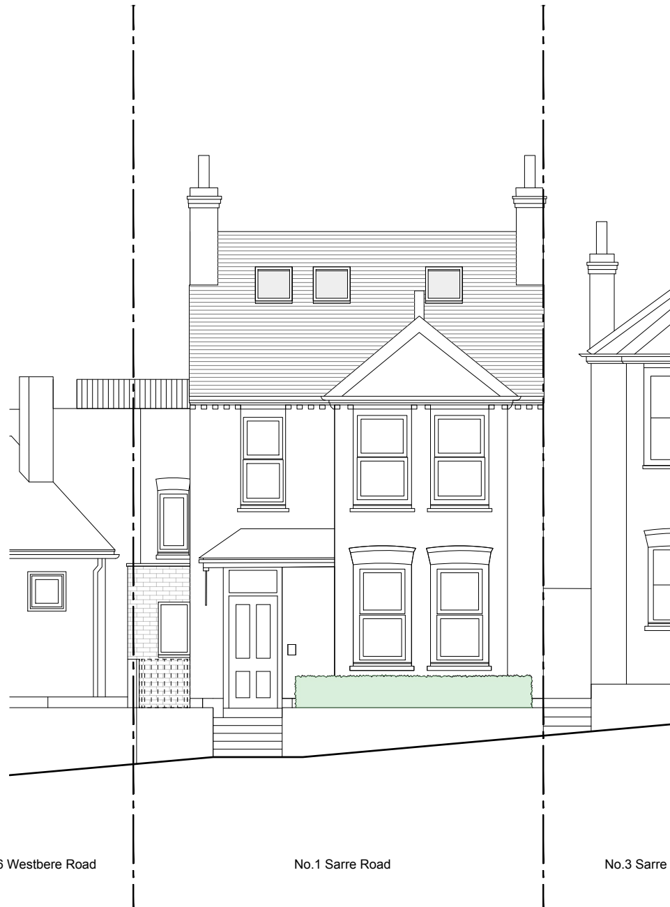
FRONT ELEVATION / SARRE ROAD

- If any discrepancies are found in the drawings these are to be brought to the attention of AURAA LTD for rectification.