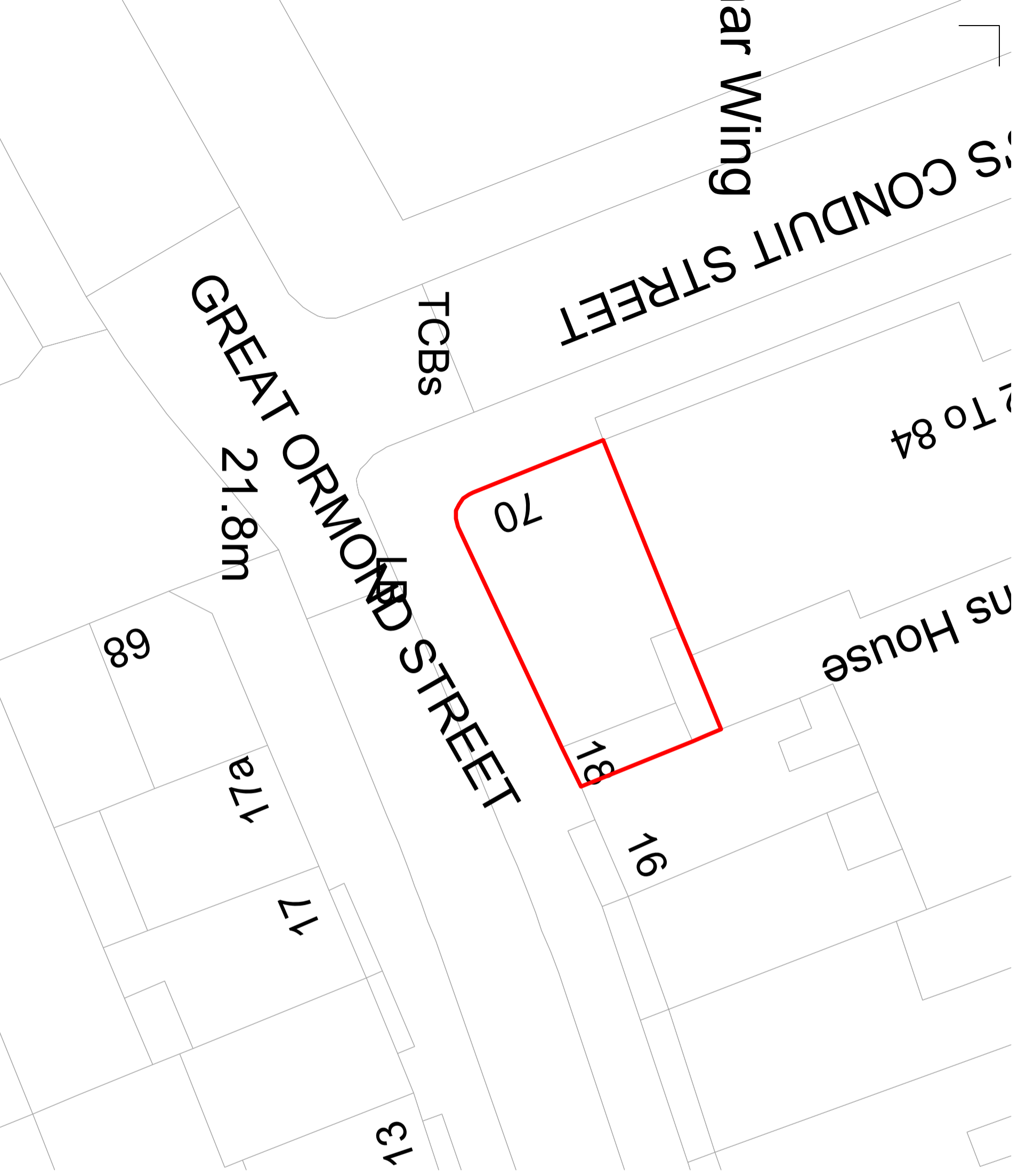
BLOCK PLAN (1/200@A3)