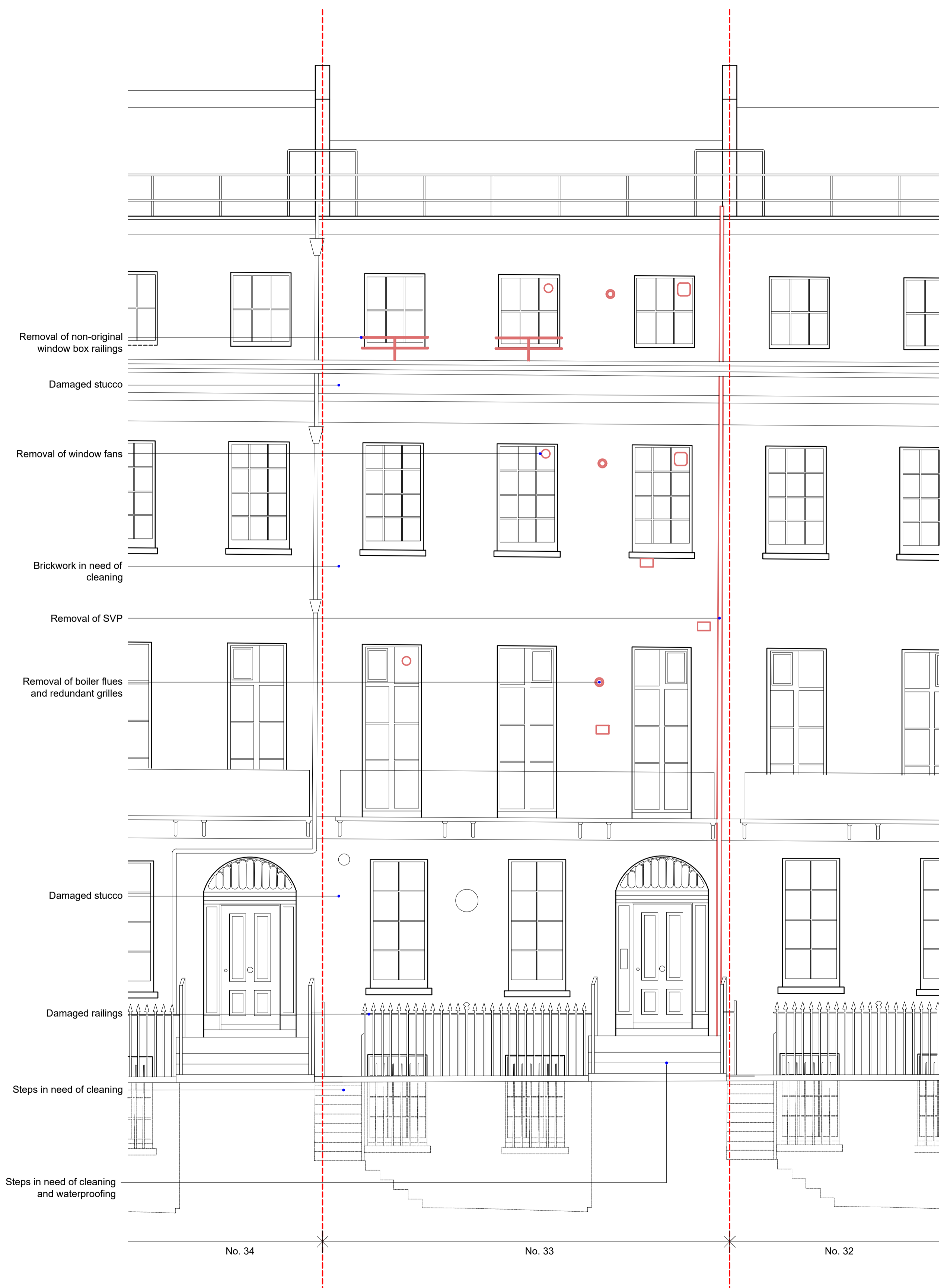
1 / Existing East Elevation 1:50