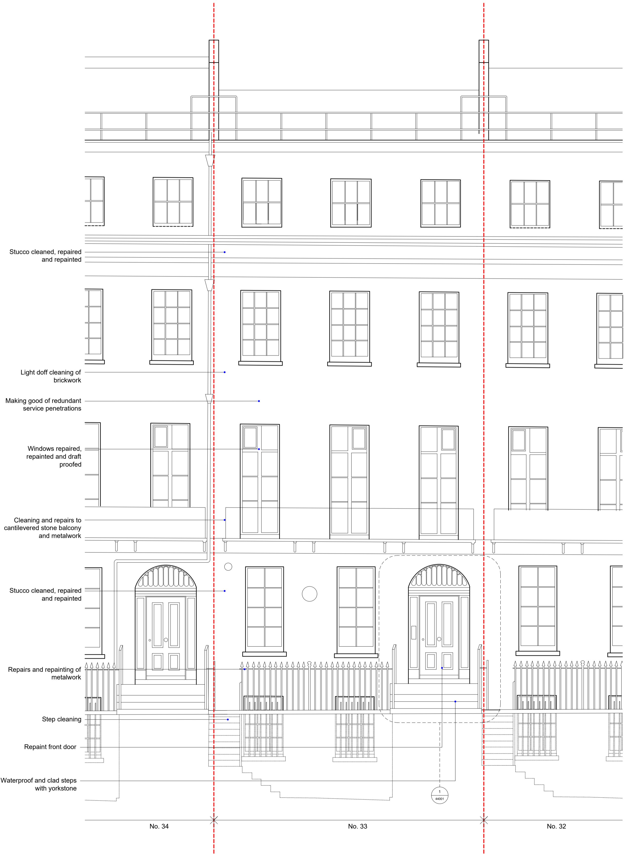
1 / Proposed East Elevation 1:50

TO BE READ IN CONJUNCTION WITH GA PLANS, SECTIONS AND ELEVATIONS.