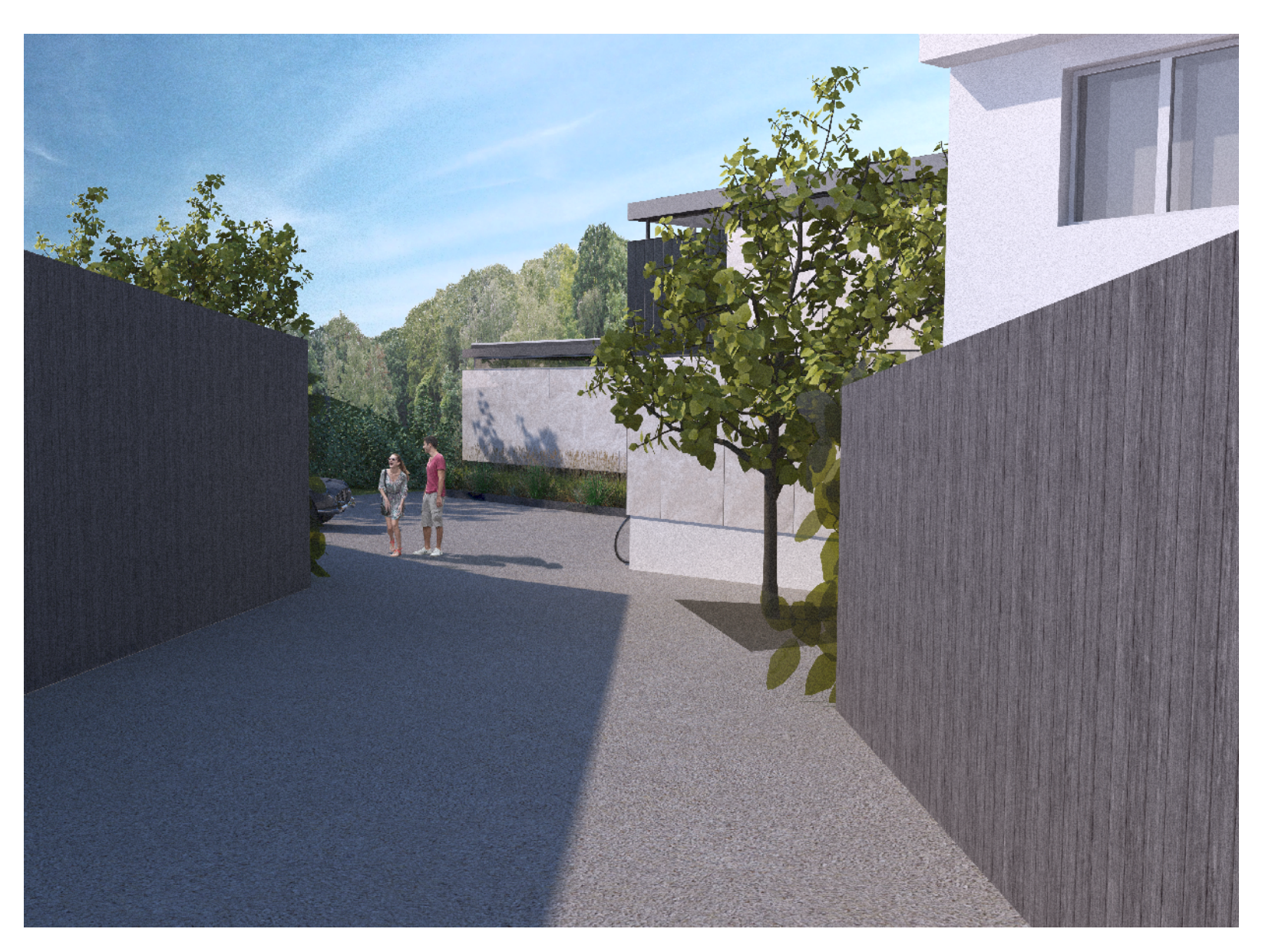
Street view from The Terrace (South of the site)