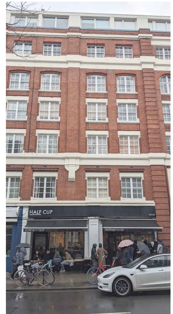
EXISTING SHOP FRONT