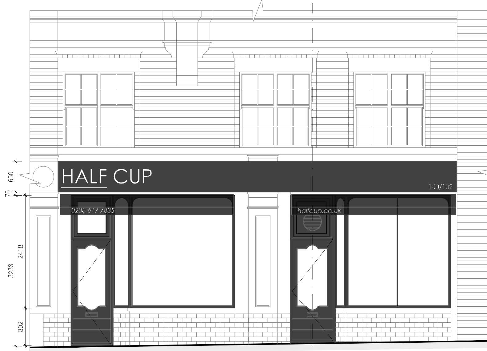
EXISTING SHOP FRONT ELEVATION 1:50@A3