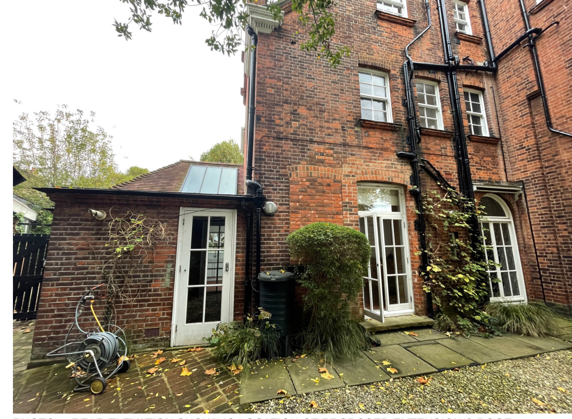
PHOTO 7: REAR ELEVATION SHOWING LOCATION OF PROPOSED EXTENSION & ROOF ADJUSTEMENT