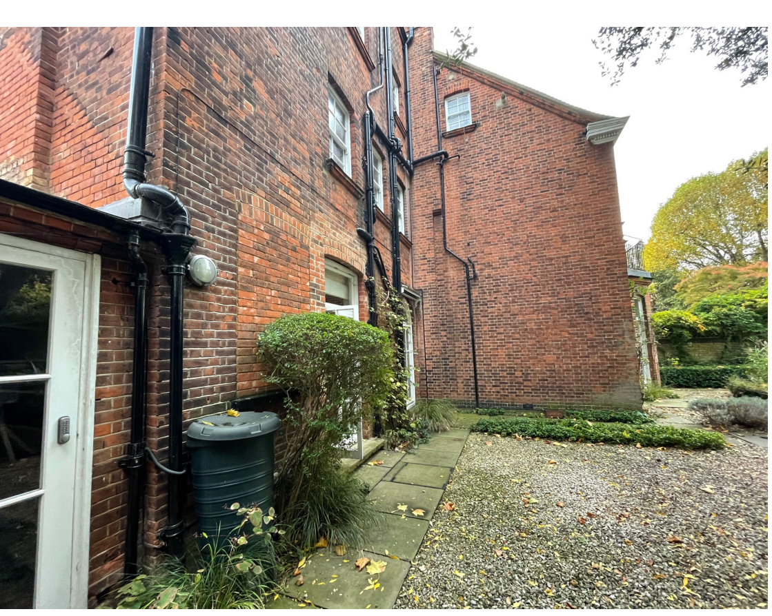
PHOTO 9: SIDE ELEVATION SHOWING LOCATION OF PROPOSED EXTENSION & EXTERNAL VIEW OF PHOTO 8