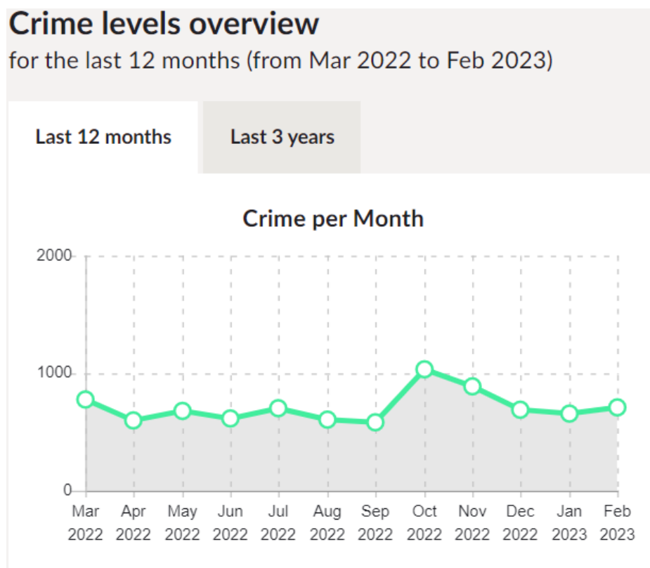
Line graph showing the rates of crime for Bloomsbury ward over the last twelve (12) months

London. Camden’s Statement of Licensing Policy sets out the Council’s approach to licensing and special licensing policies apply to these areas.”