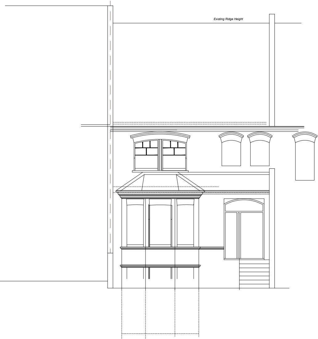
Existing Front Elevation (north)