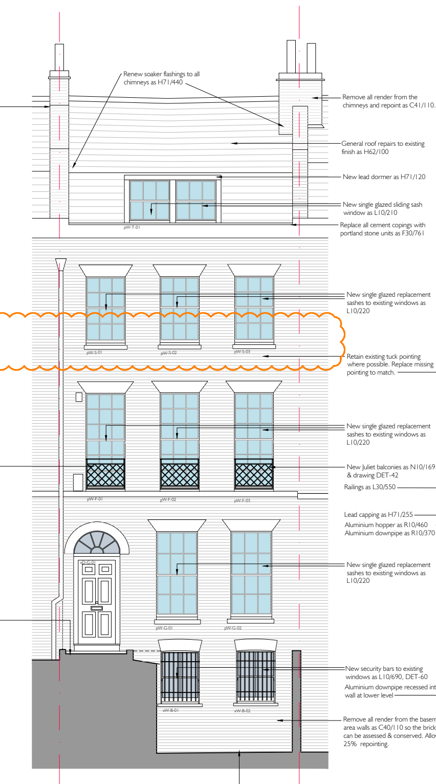
B 200 FRONT ELEVATION AS PROPOSED