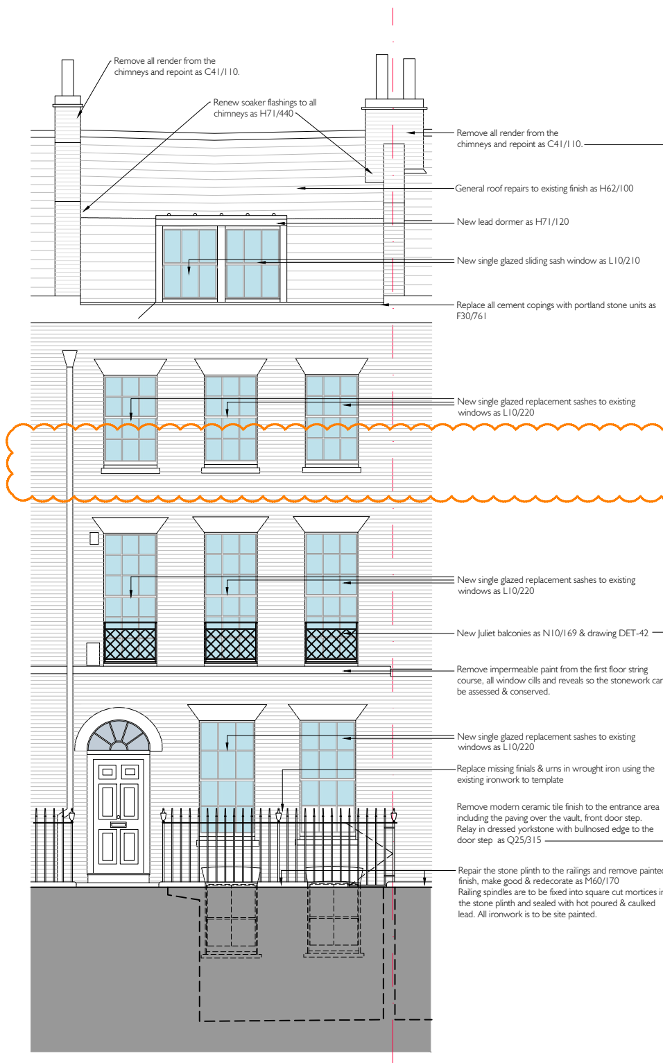
A 200 STREET ELEVATION AS PROPOSED