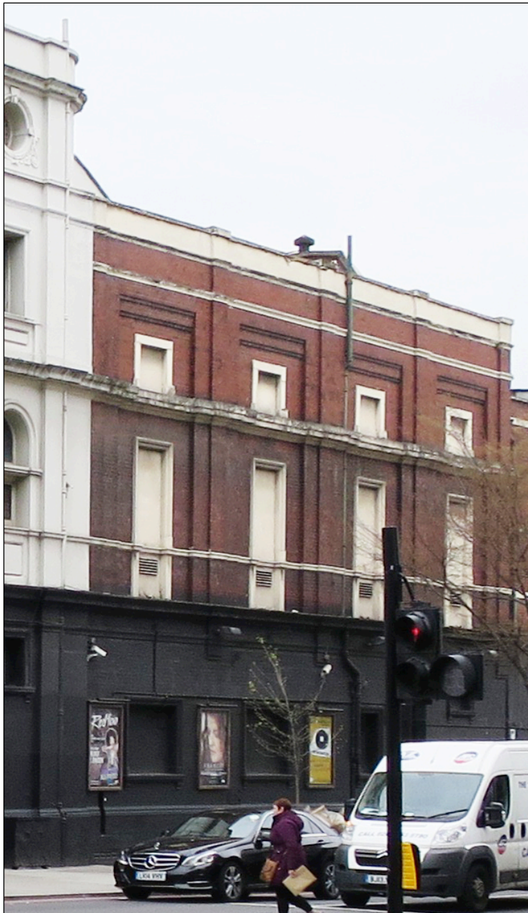
Photo : SIGNS 6a - showing existing advertisement signage on Crowndale Road