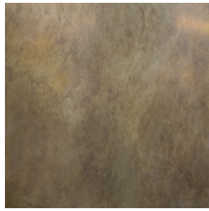
Image showing Aged Brass for Screen Frame & Linear Wall Picture Lights