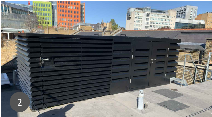
EXAMPLE OF ACOUSTIC ENCLOSURE - COLOUR RAL 7016