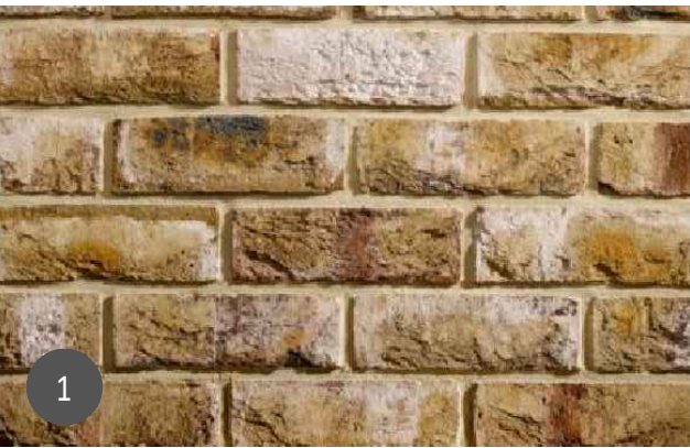
EXAMPLE OF TYPICAL LONDON STOCK TRADITIONAL BRICKWORK TO LIFT OVERRUN