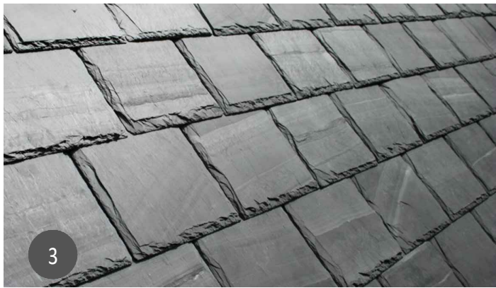
EXAMPLE OF EXISTING SLATE TILES TO BE REPAIRED OR REPLACE.