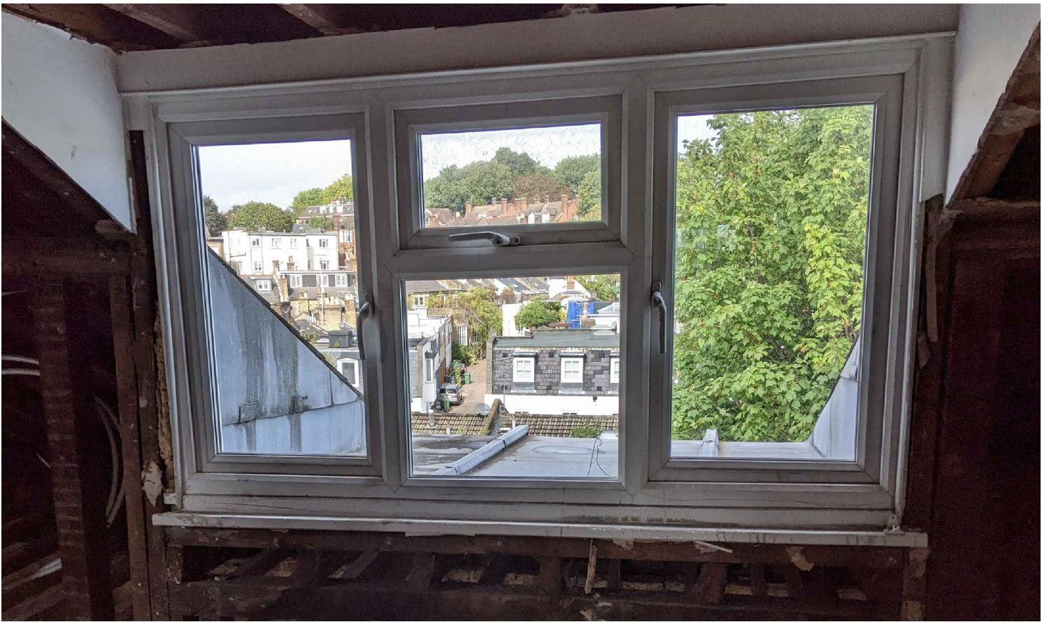
Existing dormer window looking towards rear garden.