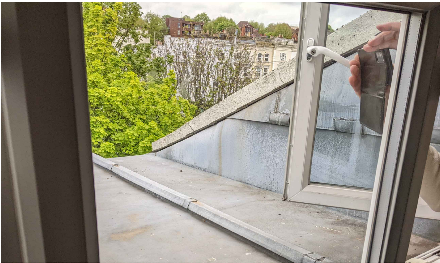
Existing dormer window looking rear towards party wall

ALL DIMENSIONS AND LEVELS TO BE CHECKED ON SITE BEFORE COMMENCING WORK. ANY DISCREPANCIES SHALL BE IMMEDIATELY NOTIFIED TO THE ARCHITECT IN WRITING. DO NOT SCALE FROM THIS DRAWING. USE FIGURED DIMENSIONS ONLY. IF IN DOUBT CONSULT THE ARCHITECT. © GODDARD MANTON LIMITED