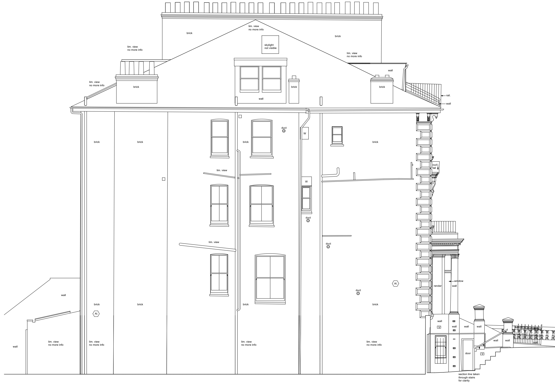
1 Existing Side Elevation Scale: 1:100 @ A3