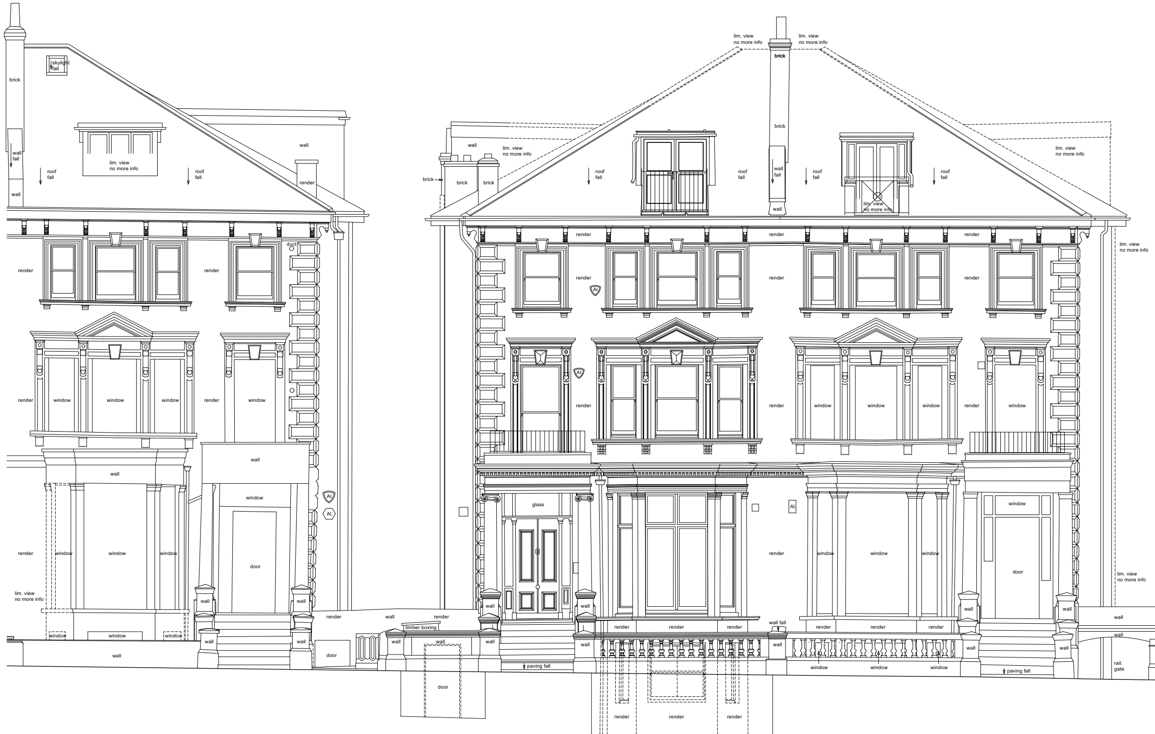
1 Existing Front Elevation Scale: 1:100 @ A3