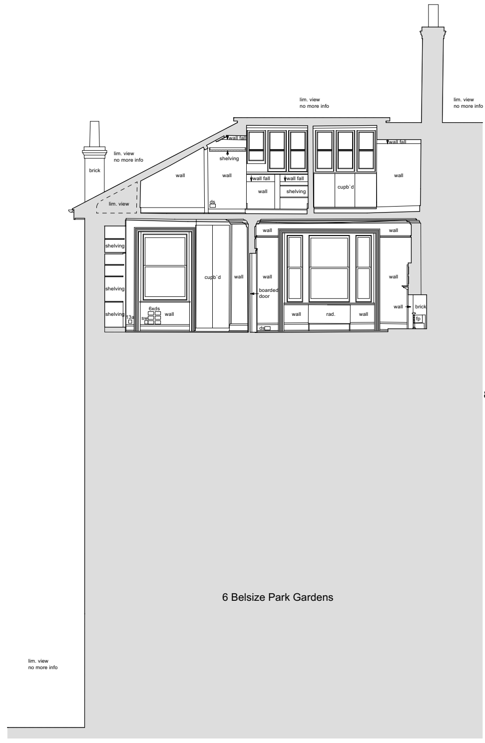
2 Existing Section 2 Scale: 1:100 @ A3