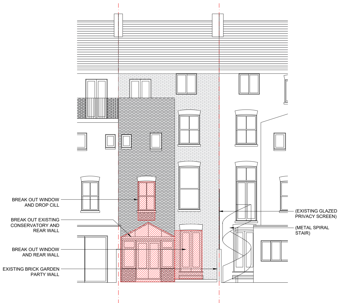
xAA EXISTING ELEVATION AA 0 0.5 1 2 3 1:50 at A1 DEMOLITION

- Use figured dimensions only. - Do not scale from this drawing. - Issued for purpose indicated only. - All dimensions to be checked on site. - Architect to be notified of any discrepancies before construction commences. - Structural and services information is indicative only - refer to consultants' drawings and specification for details and setting out. - All work and materials to be in accordance with current applicable statutory legislation and to comply with all relevant codes of practice and British and European standards. - Information contained within this drawing is the sole copyright of Aaron Birch Architecture and not to be reproduced without written permission.