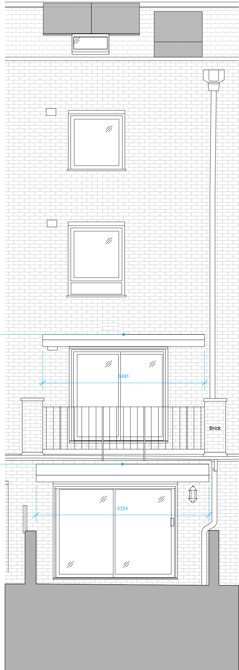
2 Rear Elevation Scale: 1:50