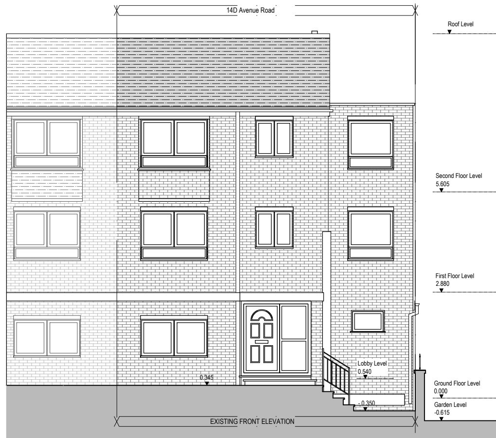
EXISTING FRONT ELEVATION SCALE 1:100 @ A3