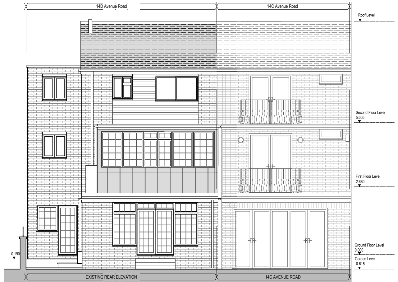
EXISTING REAR ELEVATION SCALE 1:100 @ A3