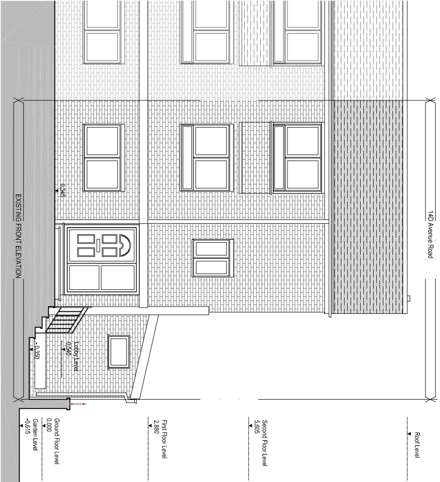
EXISTING FRONT ELEVATION SCALE 1:100 @ A3