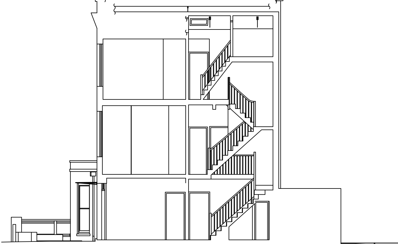
EXISTING - Flank Elevation