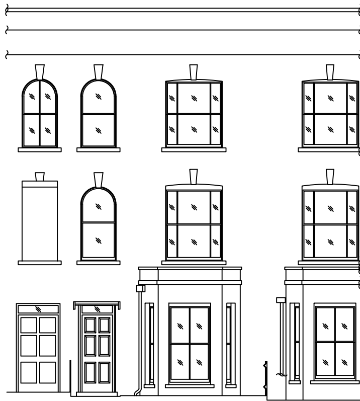
EXISTING - Front Elevation