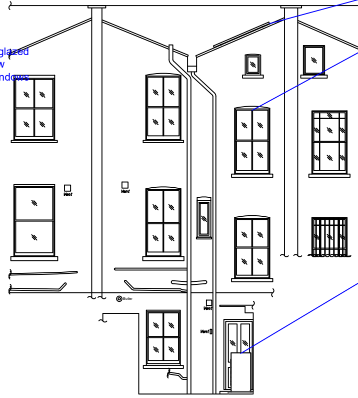
PROPOSED - Rear Elevation