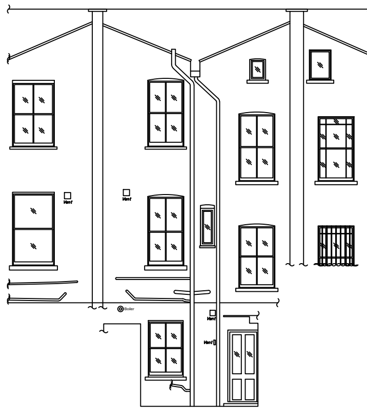
EXISTING - Rear Elevation