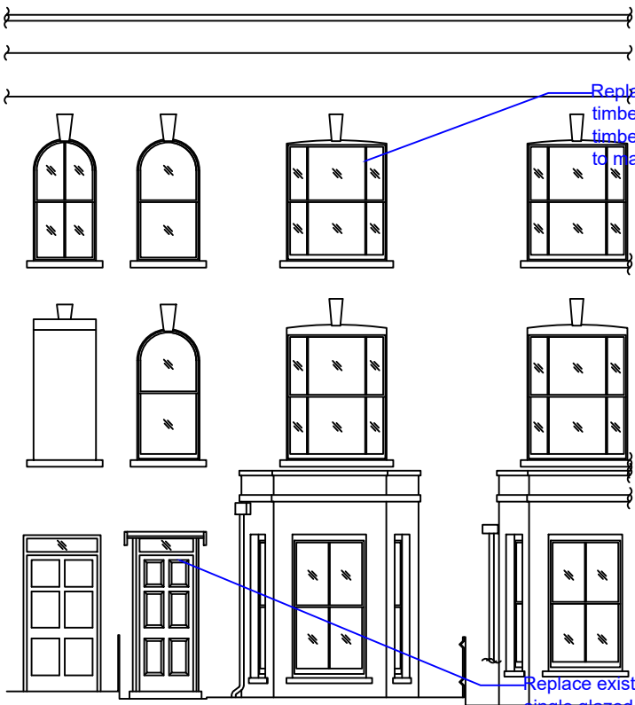
PROPOSED - Front Elevation