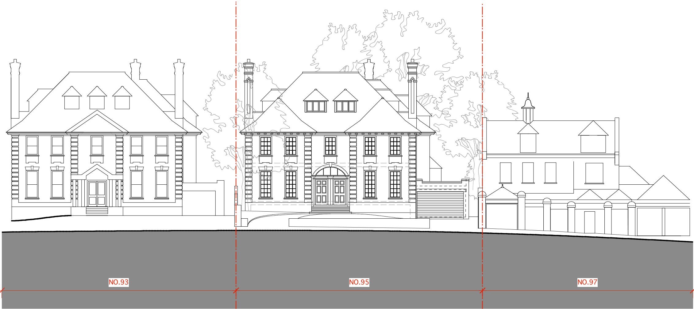
Existing street elevation