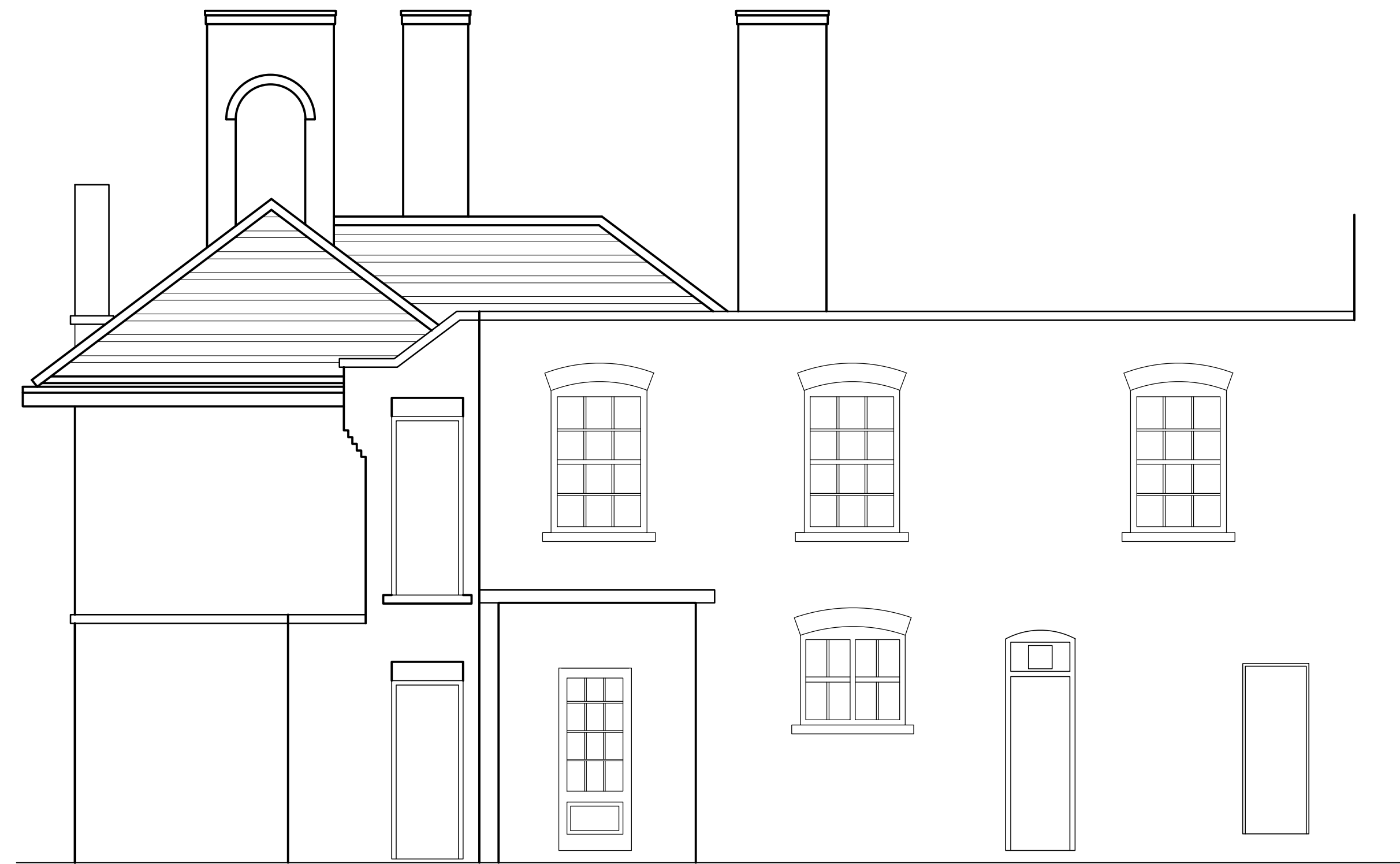
EXISTING ELEVATION TO NORTH END