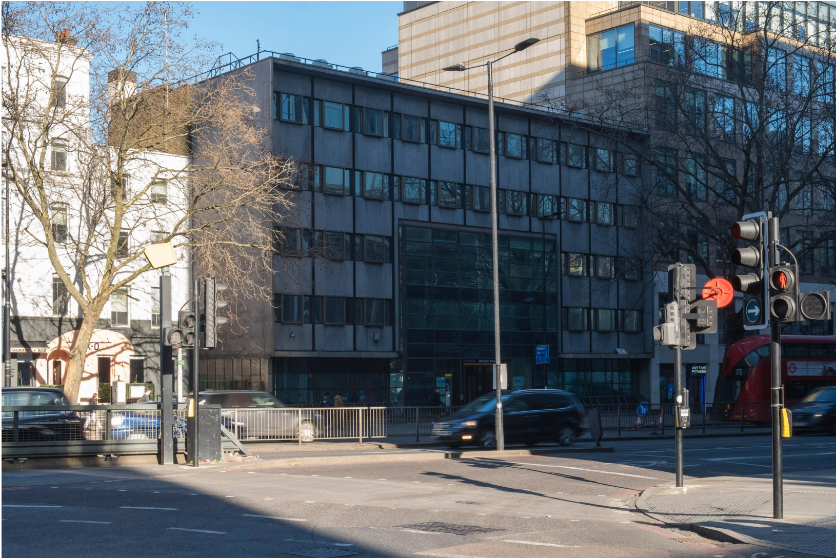
External views (Front of building) Below - Aerial view.

Project Summary Refurbishment of third floor offices to create new agile working space Planning Implications New external condensers, replacement of existing heat pumps