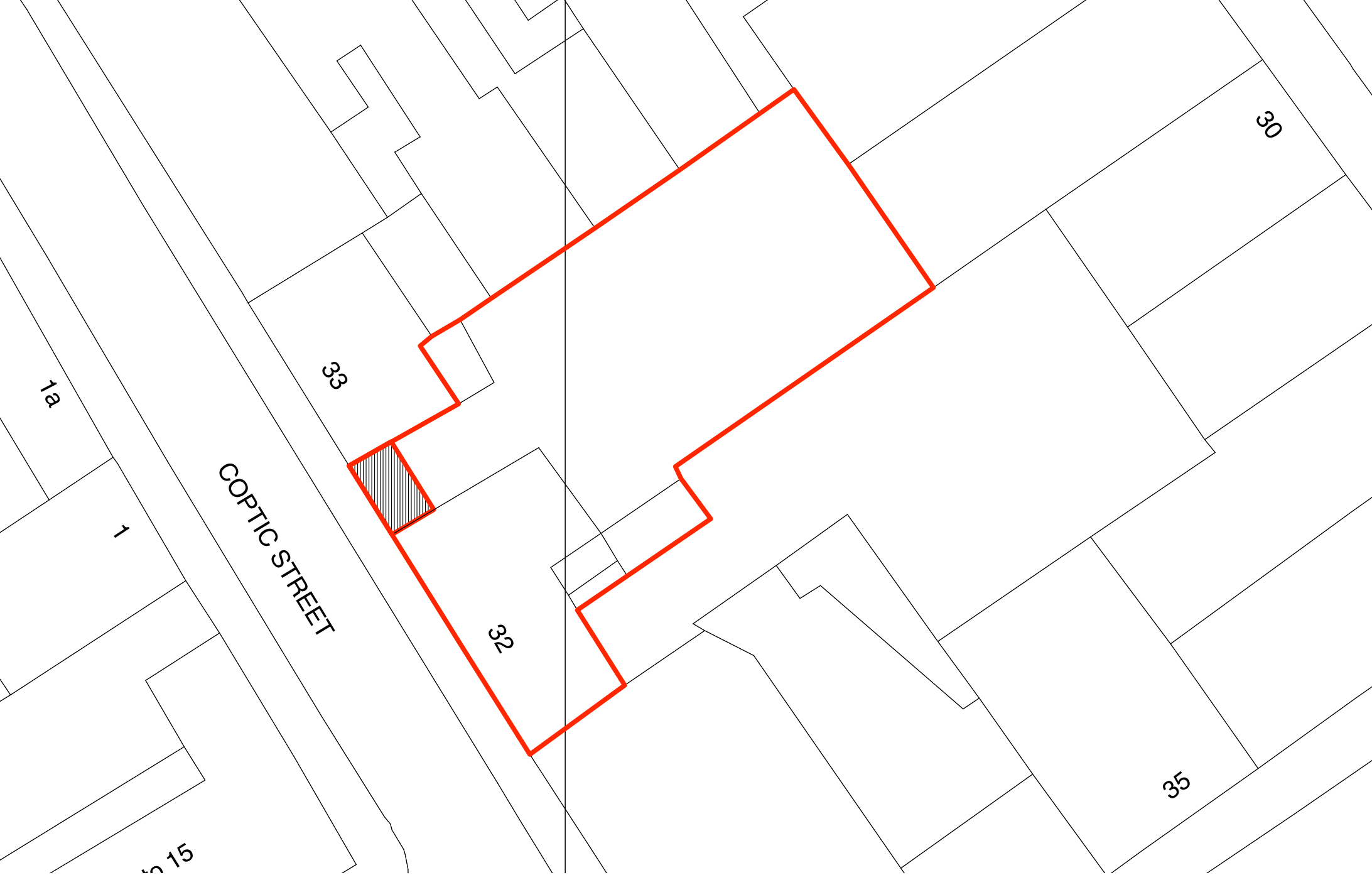
Site Plan 1:200