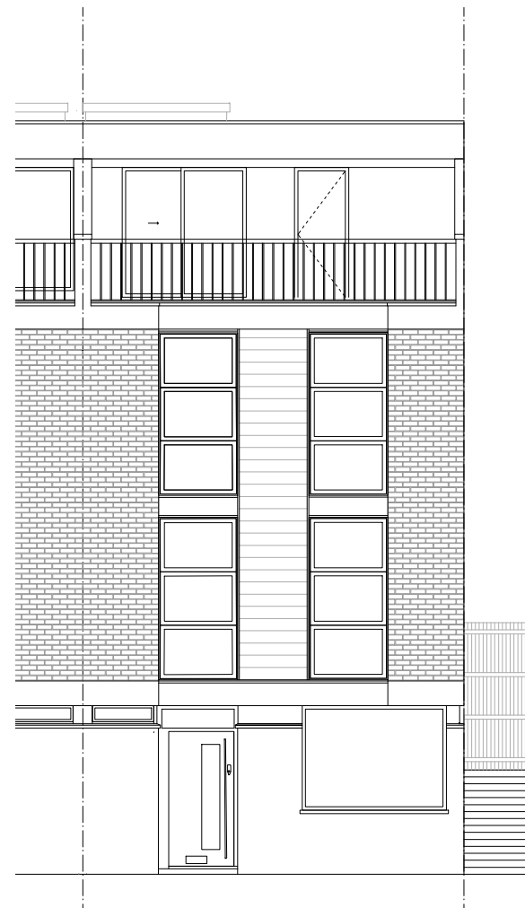
(00)250.01 Front Elevation