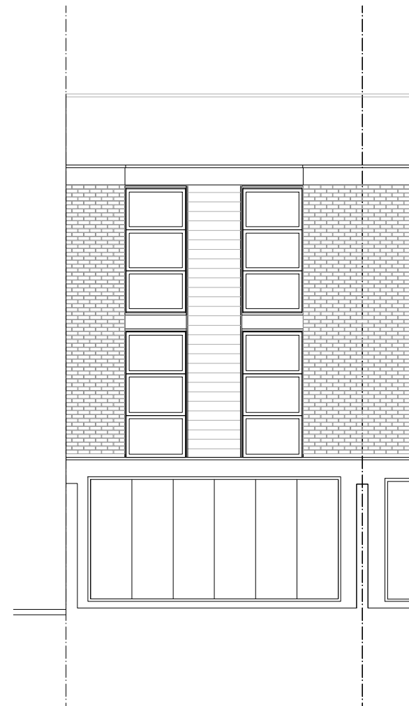
(00)250.01 Rear Elevation