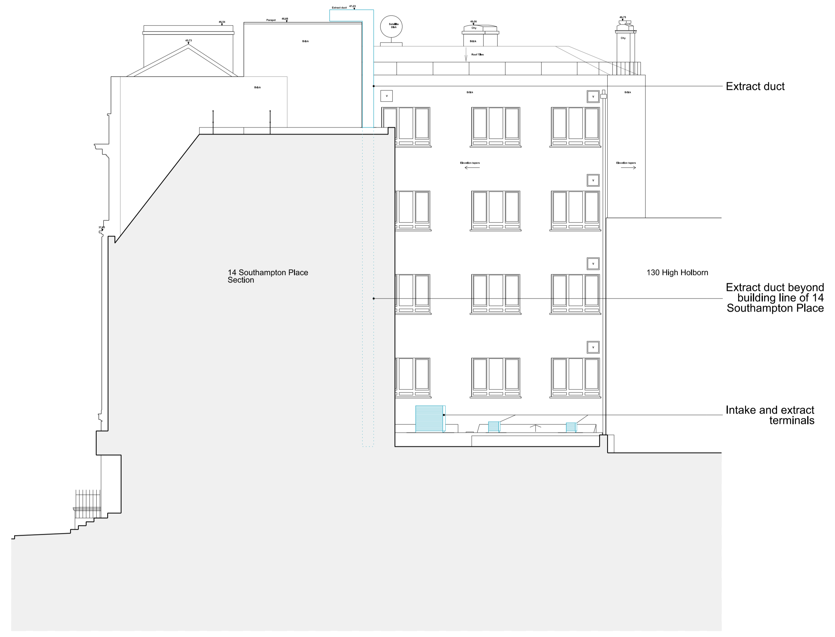
Proposed North Elevation 02 19521