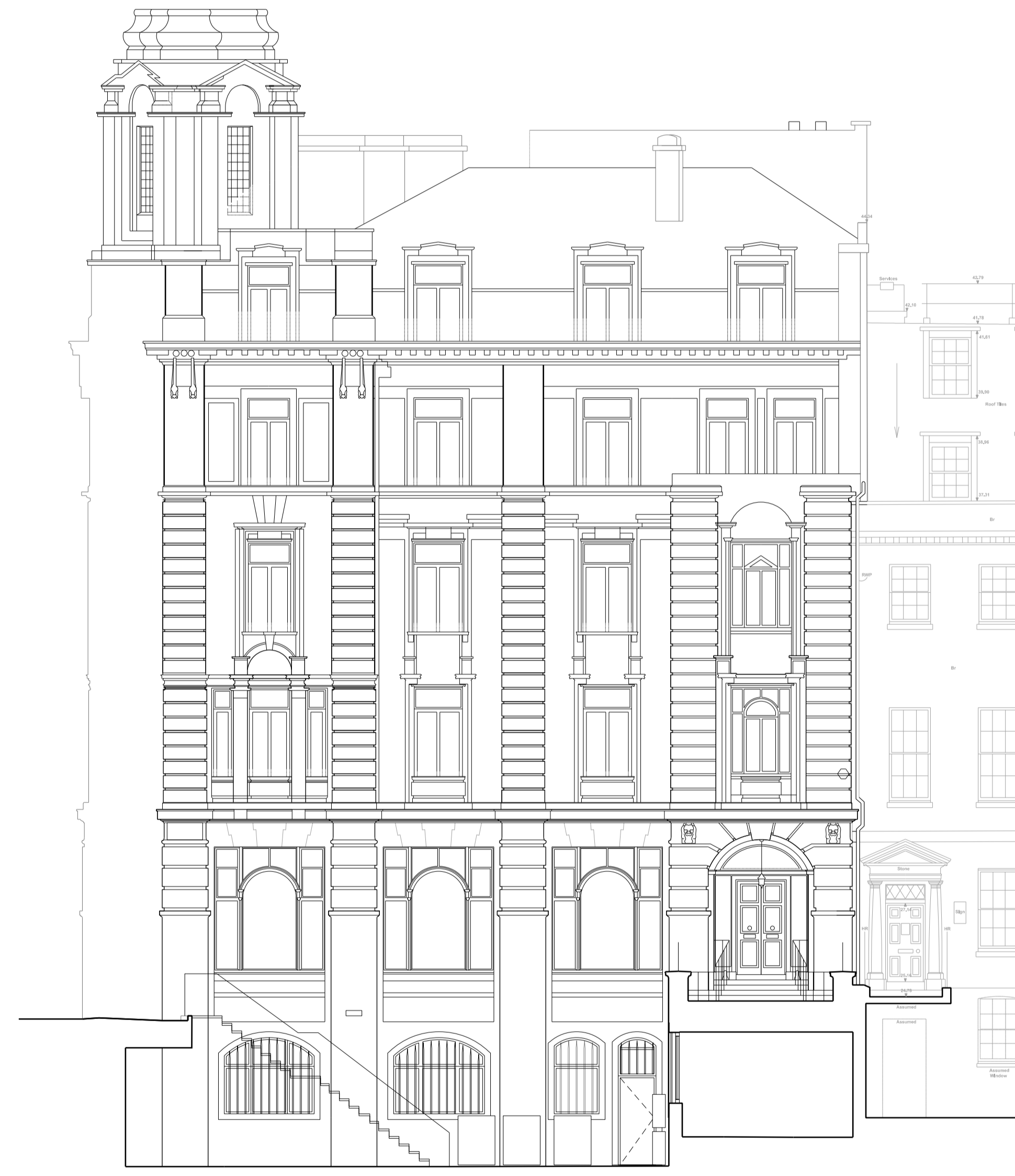
Existing East Elevation 03 741-19020