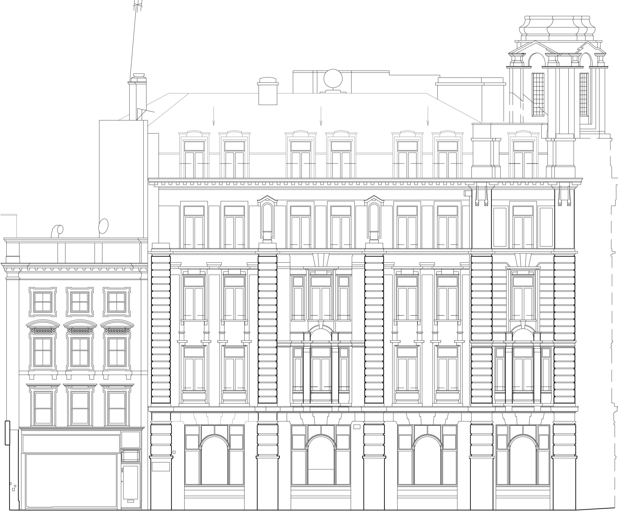
Existing South Elevation 01 741-19020