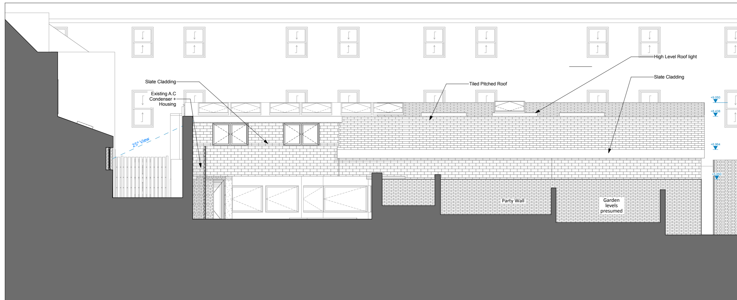
P_405 Existing West Elevation 1:100