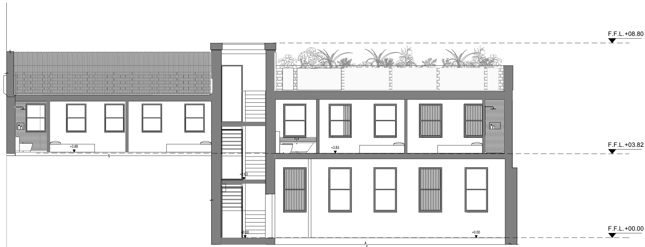
3 Section CC