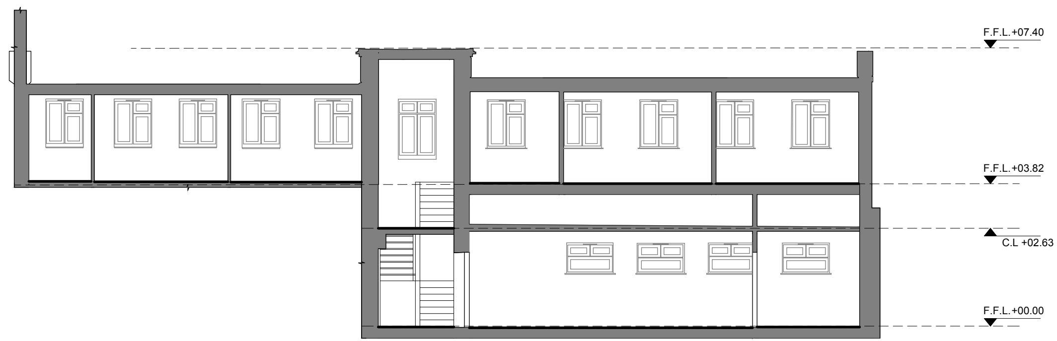
3 Section CC