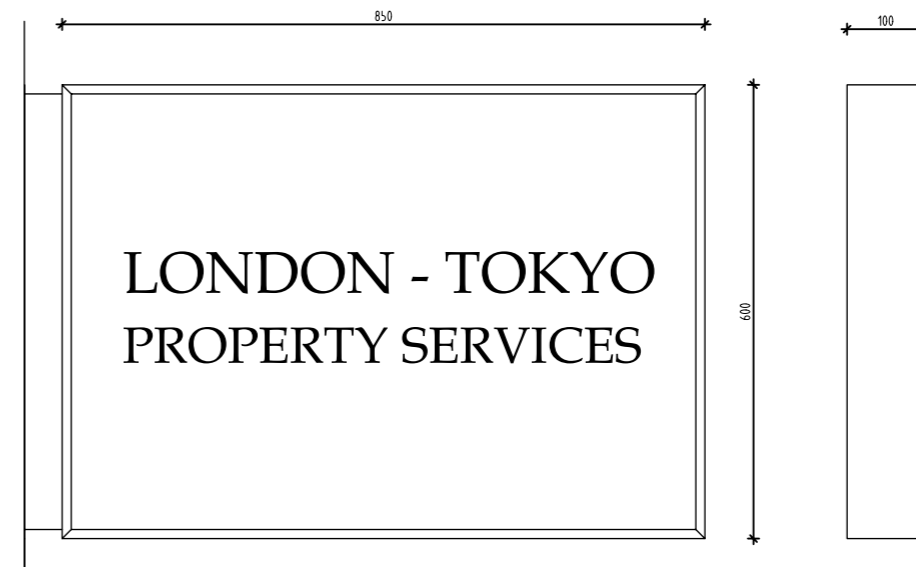
PROPOSED PROJECTING SIGNAGE 1:10

Revision B by DND 18th April 2023 minor alterations to signage. signage not to be illuminated.