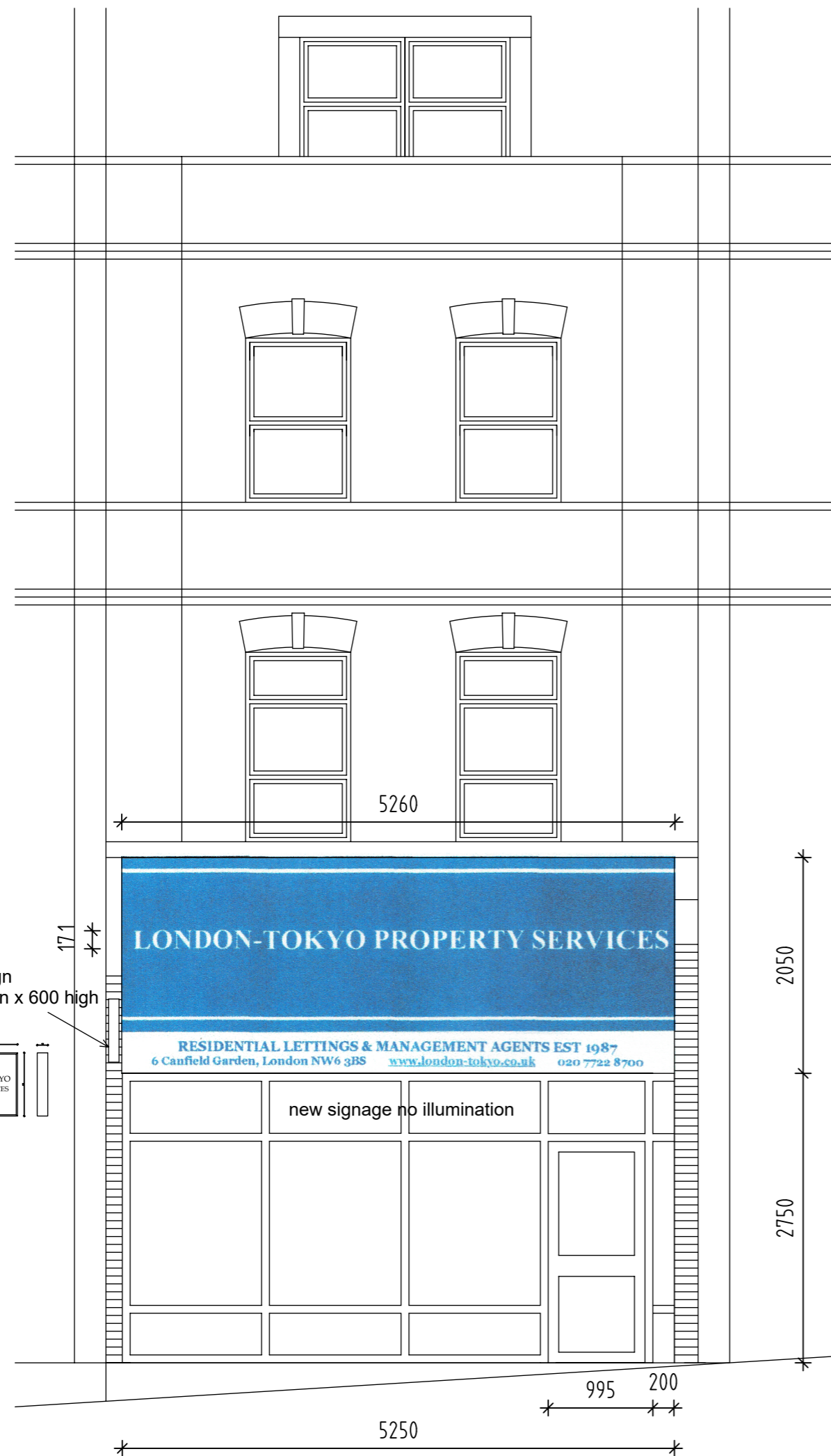
PROPOSED ELEVATION FROM CANFIELD GARDENS 1:50