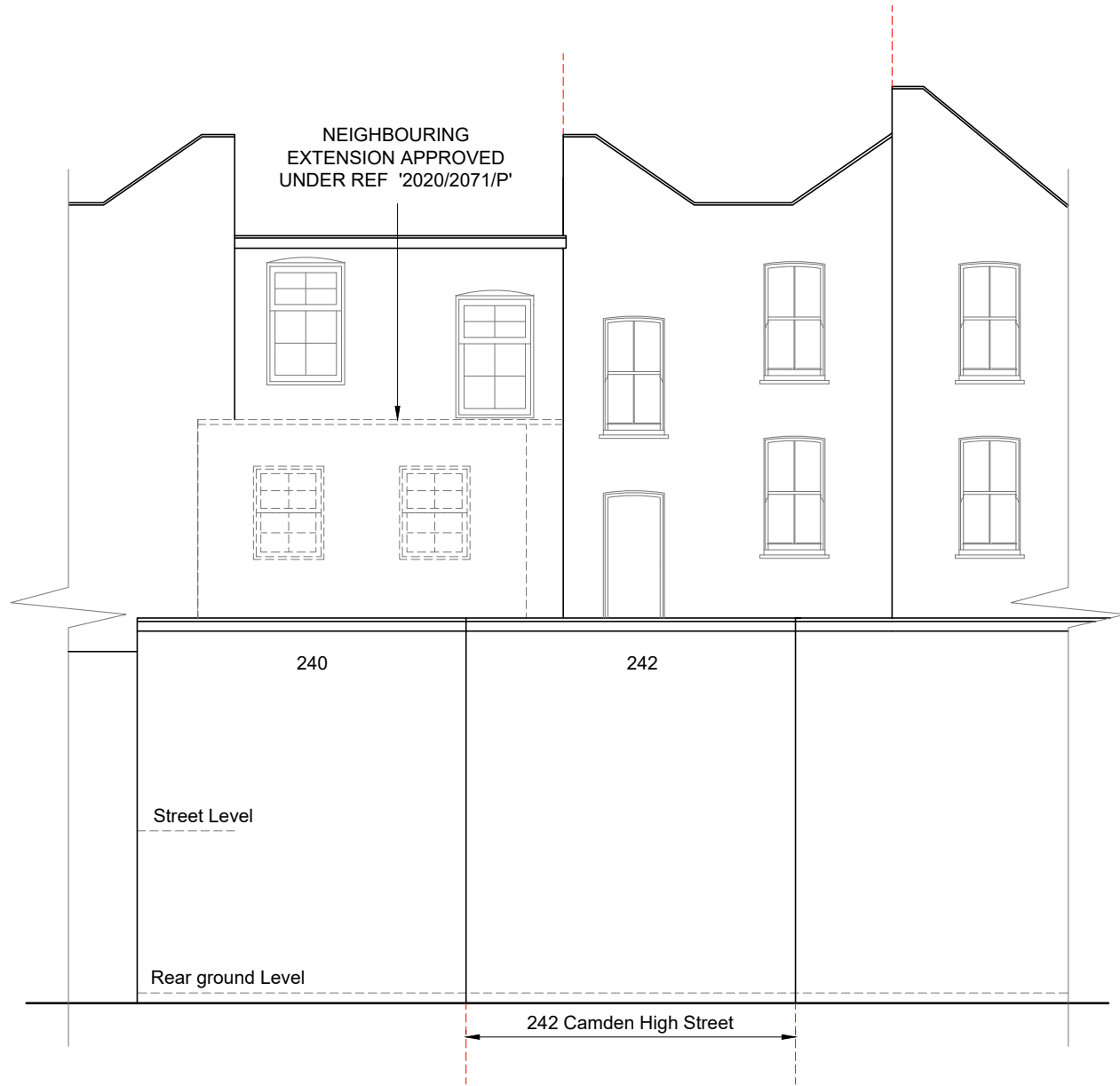
EXISTING REAR ELEVATION SCALE: 1:100

This drawing is the property of Orb Property Planning Ltd and may not be reproduced, loaned or copied, in part or in full, without the prior written consent of Orb Property Planning Ltd. This drawing is not for construction purposes, unless otherwise stated. The Contractor is responsible for checking all dimensions before any work starts or any materials are ordered. Any discrepancies must be brought to the attention of Orb Property Planning Ltd immediately.